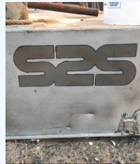
BEFORE Sandblasted white metal

S2S HD Corrosion Shield bonds to metal for long lasting adhesion. It does not typically need to be removed before reactivating equipment but if desired simply wash with a high pH detergent and water.