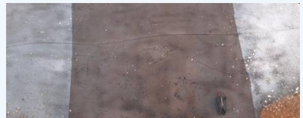
BEFORE Sandblasted white metal. Center coated in S2S