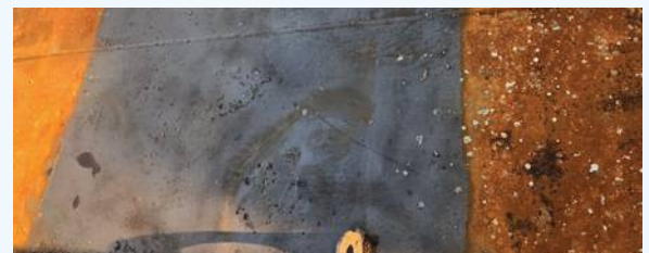
AFTER Coated area rust free after 12 months exposure on Gulf of Mexico