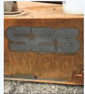
AFTER 6 months exposure on Gulf of Mexico