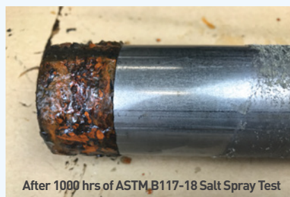
After 1000 hrs of ASTM B117-18 Salt Spray Test