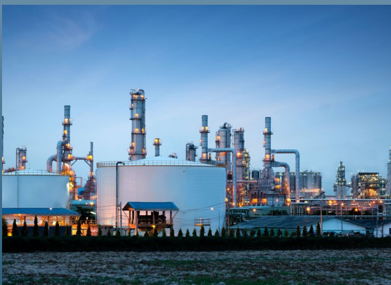
Oil & Gas Industry