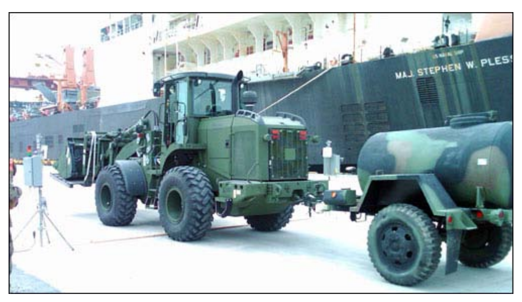
Mobile UHF RFID readers are deployed at ship loading ramps and lift-on, lift-off choke points.

Blount Island Command's cargo containers bear multiple ID tags and labels. At approximately the same time that the command was launching the passive RFID test, the DOD began mandating that each cargo container and vehicle have an Item Unique Identification (IUID) label, with a Unique Item Identification (UII) number printed in text and bar-code format. Also attached to every container or vehicle is a separate bar-coded label, with a different serial number printed as a bar code, used by an older tracking system that has not yet been phased out. Blount Island Command opted to link the item's UII number to the new MaxHD tag by writing the UII number to the tag's memory at the time that it was attached to the container or vehicle. Because the older bar-code system—which links to data about the container or vehicle—is still in use as well, each piece of equipment currently still has a bar-code label, as well as the printed IUID label and a passive EPC Gen 2 RFID tag. What's more, to meet Department of Defense requirements for containers, the active tag also remains.