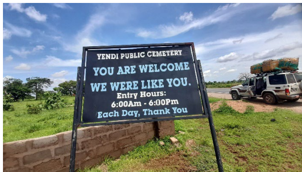
Front view for entry.

Wonderful Signpost at the Yendi cemetery with amazing warning to the living.