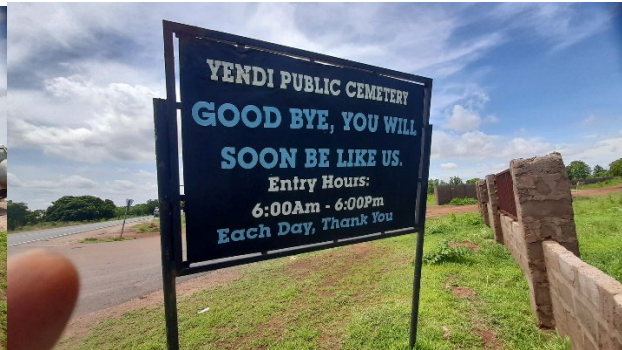
Back view for exiting.

Next, we donated clothing and study materials to the Gulnyansi congregation.