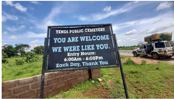
Front view for entry.