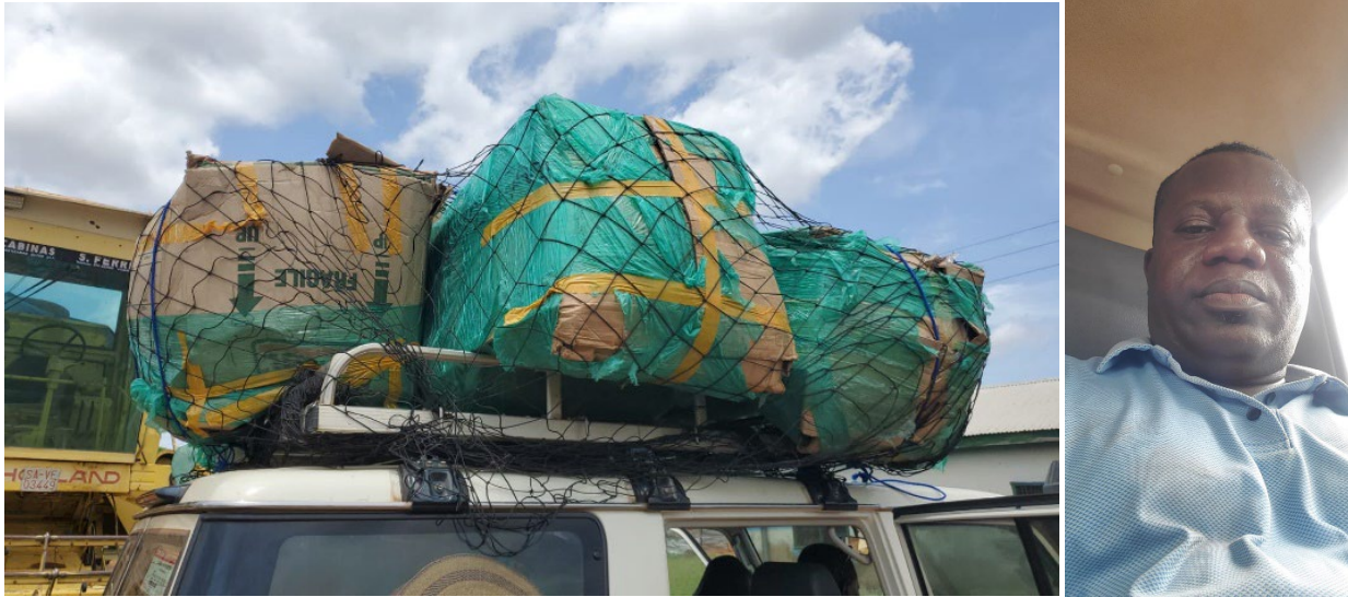
We first donated clothes and hymn books to the Yendi Church . Yendi Church building.