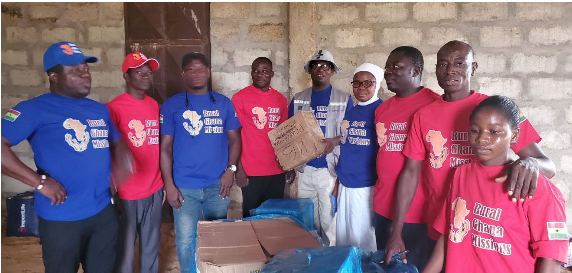
The team's dedication to improving health and sharing hope was truly inspiring.