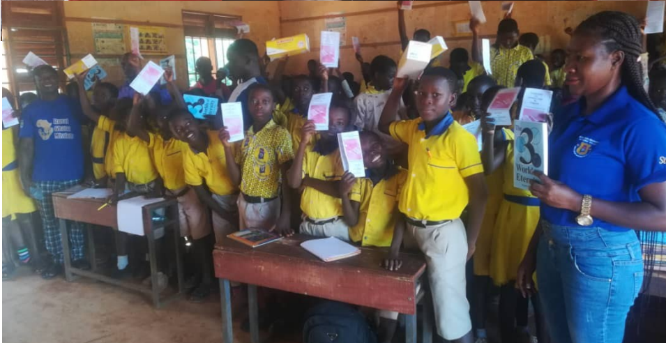
RGM Volunteers: Health Screening in Communities and School Giveaways