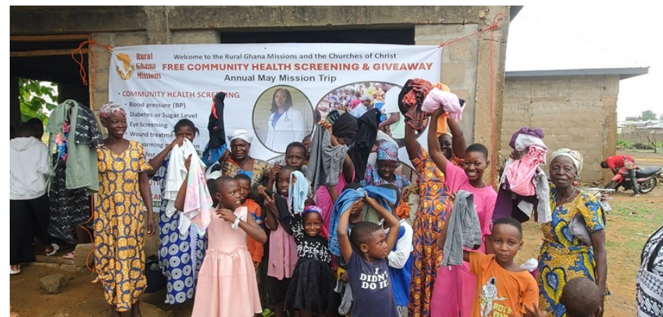
Beneficiaries of RGM health screening and giveaway expressing their joy.