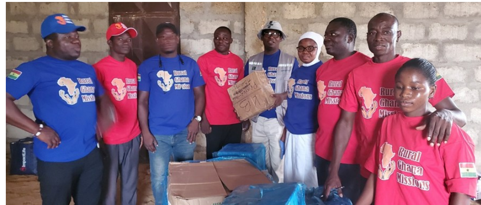
RGM Volunteers: Health Workers and Everyday Christians Serving Together