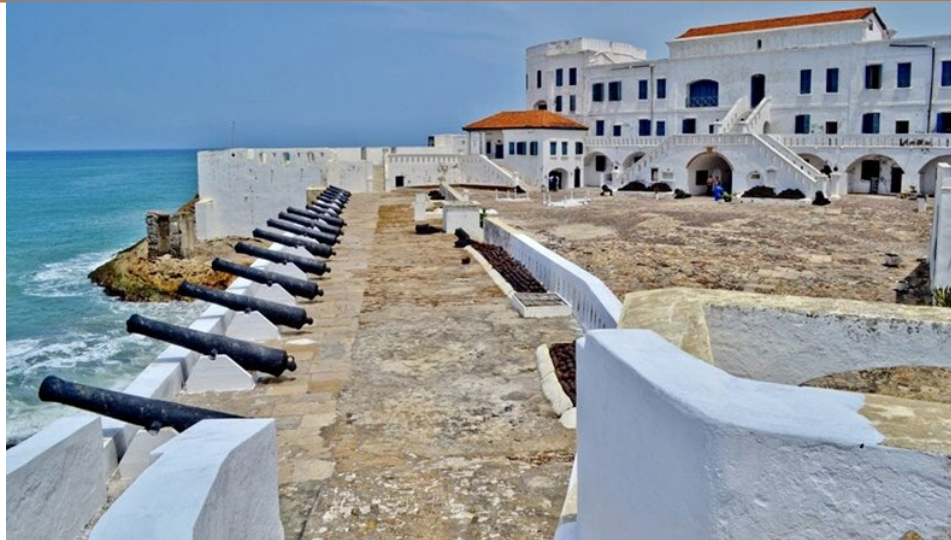
Historic Cape Coast Slave Castle

The Mission will be jointly led by native Ghanaians who are US citizens and long-term Christian missionaries to Africa. Ghana is an English-speaking country. It is very well-known for its hospitality and politically stable democracy. It has a Christian population of nearly 70% and one of the safest and most popular tourism destinations in Africa.