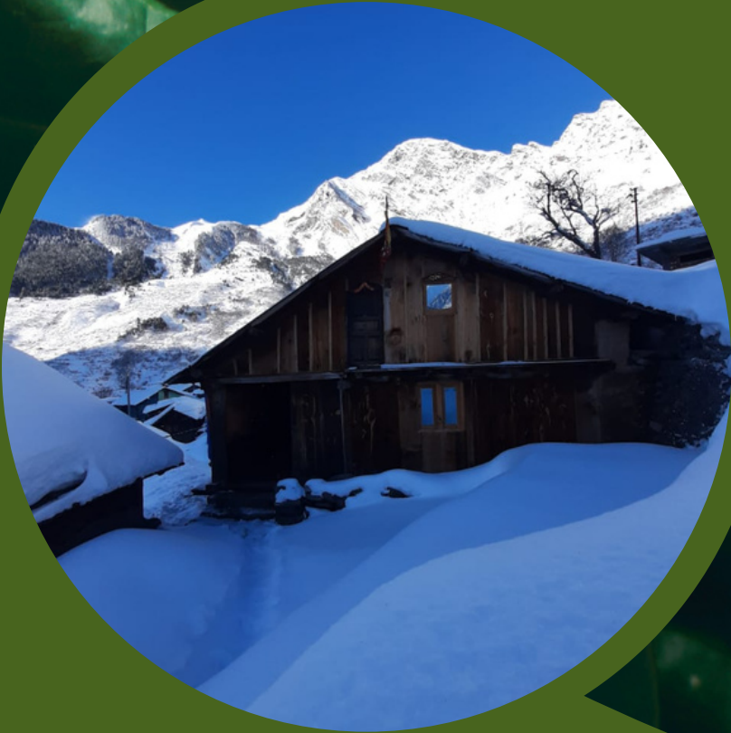
Homestay & Eco Camps