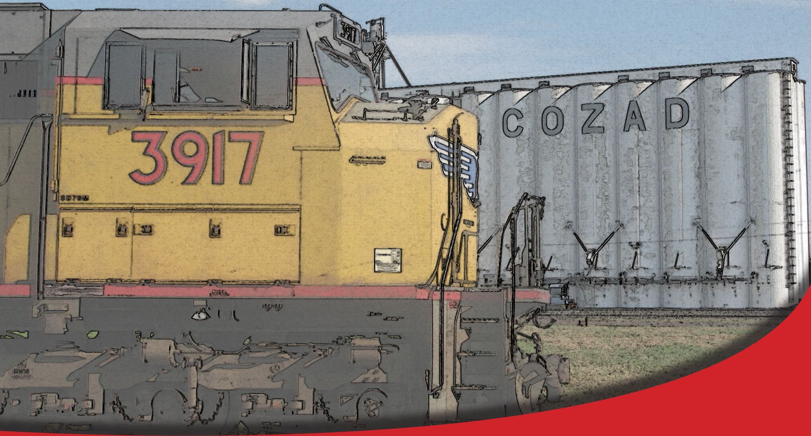
Cozad Nebraska - The 100th Meridian