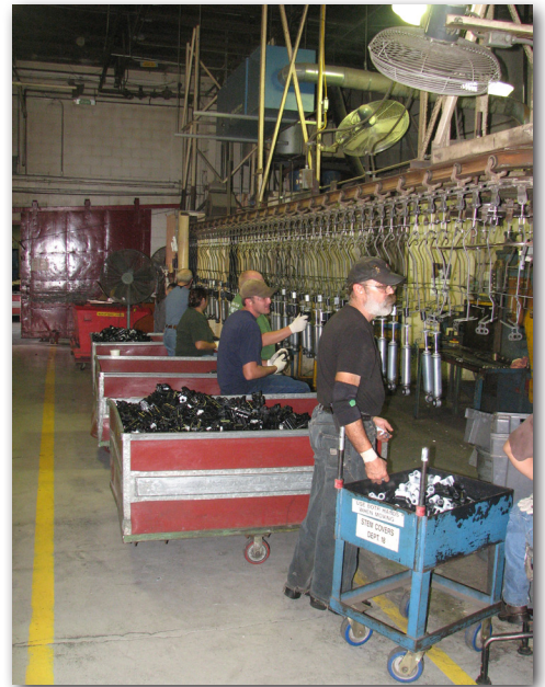
A strong and dedicated workforce.

Working with area businesses, community colleges and government entities such as Workforce Development, we are creating the workforce we need to keep our region at the forefront of economic success. From food processing to manufacturing, health care, construction and agriculture, our region boasts the infrastructure and workforce to remain leaders in their respective industry. The Cozad area workforce has a reputation for productivity and quality. This is the result of dedication to a job well done and a training investment. Workforce Development has financially committed to the retraining of the Cozad and Dawson County workforce. This is a tremendous opportunity for a corporation to secure a motivated, talented and dedicated workforce. Our workers are ready and willing to work for you! Cozad boasts virtually no unionization or work stoppages.