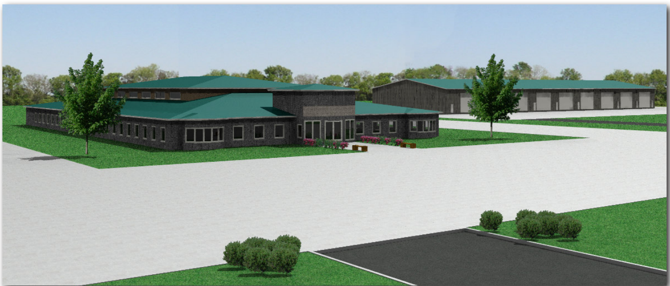
Cozad is willing to meet your structural needs.