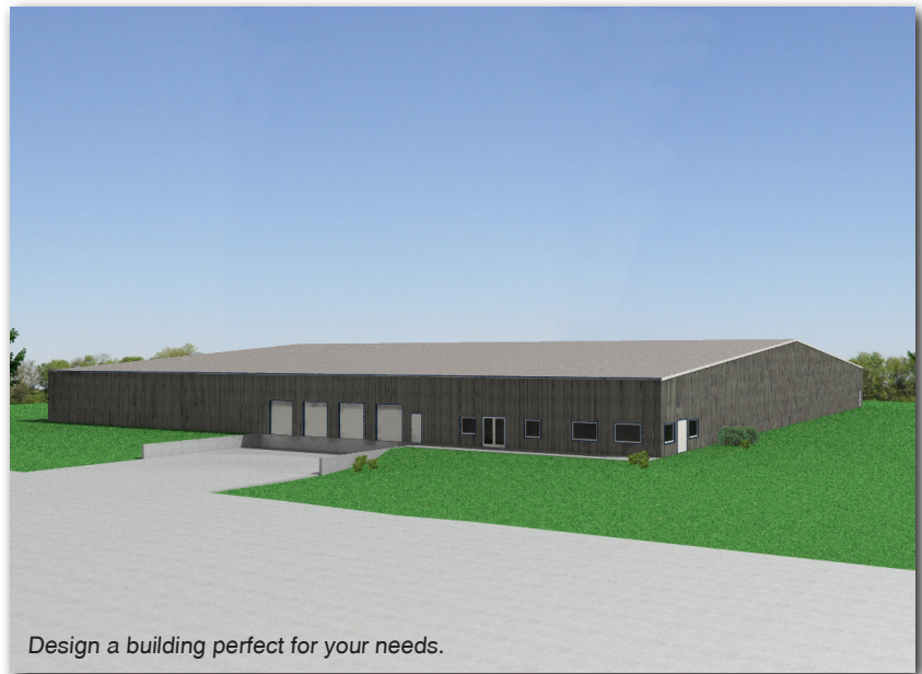
Design a building perfect for your needs.

With Cozad’s locally owned telephone, water, sewer, sanitation and electrical service, we have the capacity to offer low cost infrastructure that is essential to the growth of corporations.