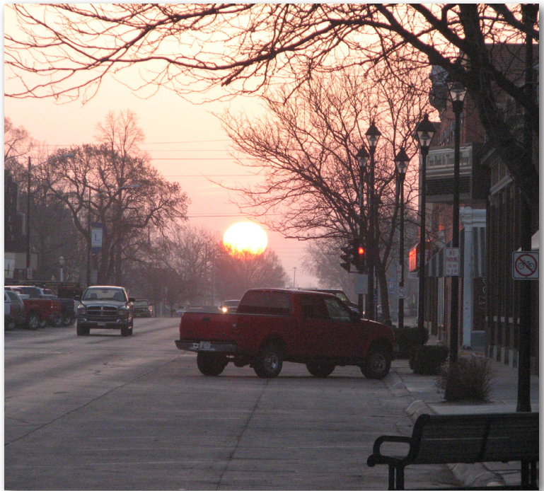
Downtown Cozad has plenty to “Discover” with a wide variety of businesses.

Opportunities for outdoor recreation are plentiful in Cozad. Take time to enjoy the beauty of our parks, play a round of golf, play a tennis match or take a walk on the Muny Park Trail. With access to boating, waterskiing, sailing, canoeing, fishing and swimming in local lakes and rivers, you can enjoy your time outside. Corn fields are abundant in Cozad; so every fall, area farmers take advantage of their crops and open their fields to the public after plowing “mazes” through the tall stocks. Pumpkin patches also provide a fun outing in the fall.