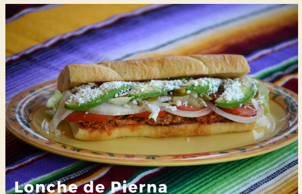
Lonche de Pierna