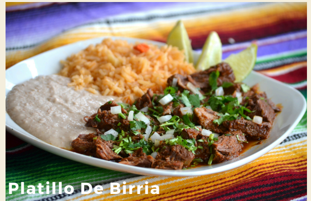
Platillo De Birria