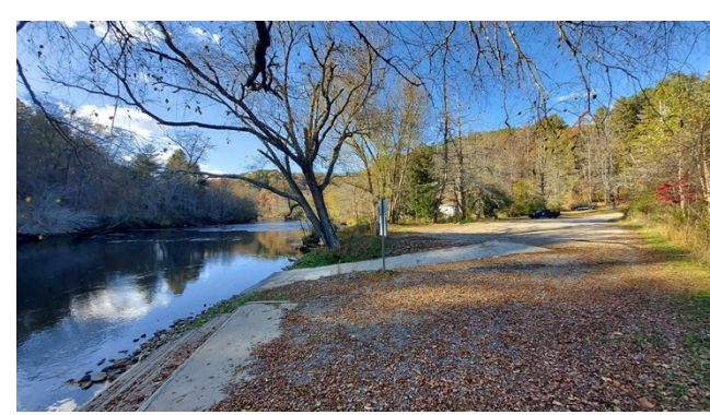
A community-wide funding and resource program, kicked off by Trout Fest '25 and coordinated by Blue Ridge Mountain Trout Unlimited, envisions upgrades to public access on the Toccoa River at North River Road in Fannin County.

In principle, the project's vision explores upgrades at the public access site to the lower Toccoa River on North River Road, located ¼-mile downstream from the river bridge at Curtis Switch Road, near Mineral Bluff. Designated COMMUNITY HEROES are stakeholders of all kinds who join Trout Fest and Blue Ridge Mountain Trout Unlimited and designate resources of many kinds to complete site upgrades across the tract of land that now only holds a worn, narrow, dirt approach to a boat ramp and 150 feet of river shoreline.