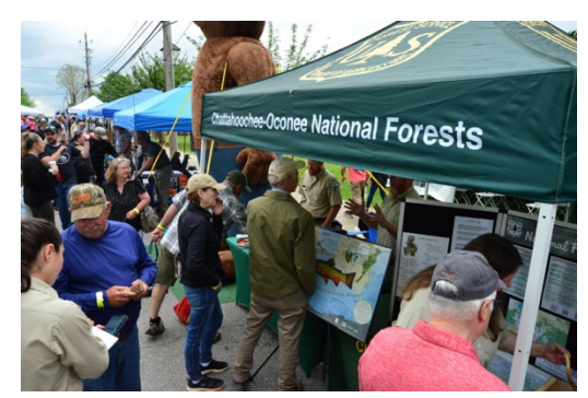
Trout Fest gathers fishermen, river sports enthusiasts and outdoor recreation fans and their families at Blue Ridge's downtown city park for recreational services, fun, food, activities, entertainment and shopping, while increasing the public's knowledge of trout and cold-water conservation associated with Trout Unlimited.

The upgrades conceived for the lower Toccoa River public-access site is a concept of agreement in principle among BRMTU and Fannin County. TVA owns the project land and, by agreement, Fannin County operates and maintains the existing site. BRMTU has offered to lead the funding and resources discovery/initiatives behind these upgrades on one of Georgia's most recognized and prized trout fisheries and paddling recreation sites. Recreation enthusiasts in kayaks, canoes and float tubes join Toccoa River anglers year 'round to enjoy its leisure