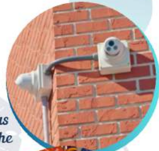
21 cameras added to the Clubhouse