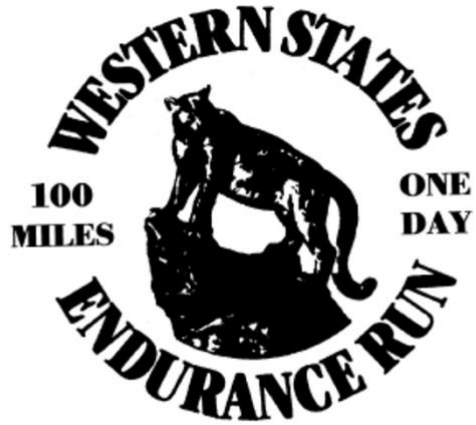
2023 QUALIFYING RACE