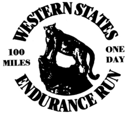
2024 QUALIFYING RACE