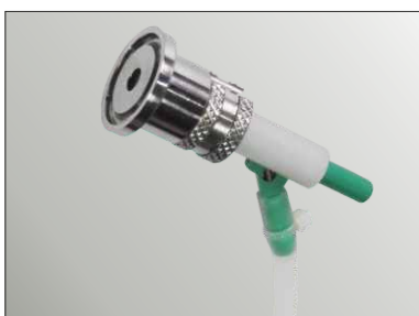
Single 'Vessel Port' connections with single as well as Multiple Sampling Ports