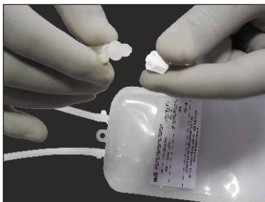
Female luer ports with male luer cap on outlet tubing on each sampling bag for easy drawing of samples