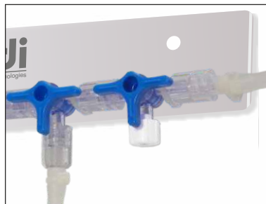
Single cut off Safety Valve: Cuts off the entire Sampling system in case of any eventuality