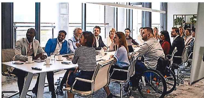
The Committee meets together and shares information and ideas and makes decisions as necessary.