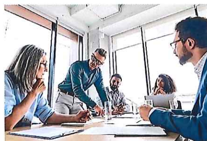
The subcommittees meet separately and report back to the full Committee with their ideas and recommendations.