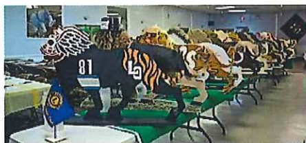
Lions in the paddock area ready to race