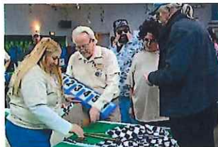
People placing their bets on the next race