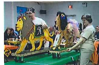
Lions racing down the track, neck and neck

Here's the details – Date, Time & Place– Saturday, April 20 th , at 5:30pm at Boulder Pointe Golf Club and Banquet Center. Cost - $30 in advance or $40 at the door Food & Beverages – Taco Bar and other refreshments and a cash bar.