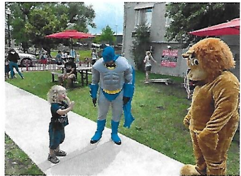
Batman & the Lake Orion Lion greet a surprised little one.