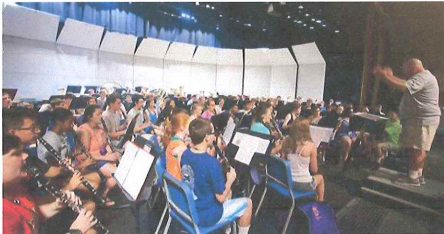
All-State Band members in rehearsal

Auditions are held each year to select the band members who will be a part of the Lions All-State Band and participate in the International Convention Parade and a variety of other activities. The rehearsals start in January of the Convention year and continue up to the start of the trip to Convention.