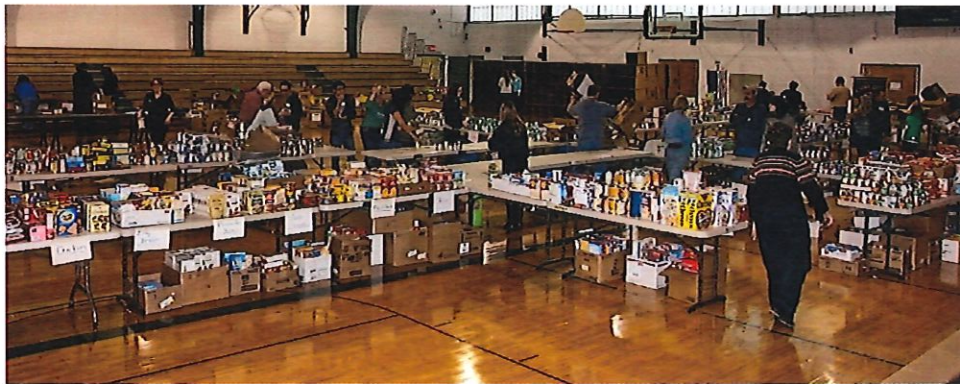
LO Lions & volunteers “shopping” for Orion area families

We had a couple inches of snow that Saturday morning which slowed down our delivery drivers a bit, but Thanks to a little extra effort by several individuals we got it done pretty much on time. I would like to give a big Thank You shout out to the members and their friends and families who helped. We have a really exceptional team.