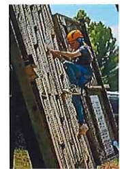
Lions Bear Lake Camp today with enlarged main building used for dining, meetings & activities, improved swimming area and the always popular rock climbing wall

Over the years new items have been added such as the rock climbing wall and the ropes course. And the buildings have been added to and re-furbished. The Lake Orion Lions have been very involved from the beginning and built one of the cabins that house those who come to camp. As a Lake Orion Lion you can be proud of what you and the other members have accomplished. Following are other ways to be involved with the Lions Bear Lake Camp.