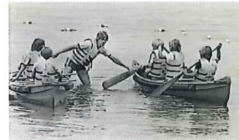
Typical camping activities at the LO Lions Camp for the blind and visually impaired youngsters who came in mid-August each year.