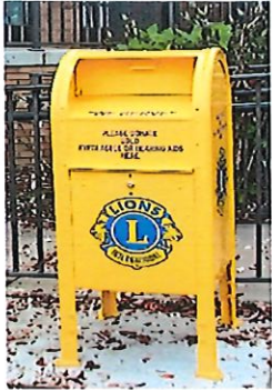
Eyeglass Collection Box at Leader Dogs Facility in Rochester

Old Mailboxes never die – they just become collection boxes for used eyeglasses. These photos show how easy it is to use.