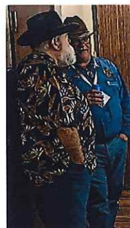
Serious business being discussed