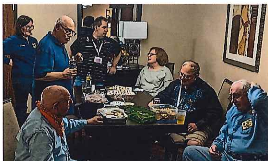
Lake Orion Lions always welcome guests wherever they are