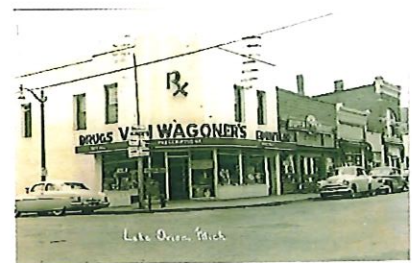
Flint Street at Broadway