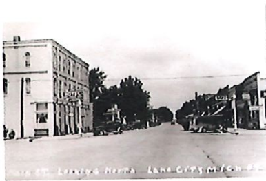
Broadway at Front Street

Folks came out from Detroit by the Inter Urban rail line on Memorial Day, opened their cabins or rented a house or a room for a week or two. Dad took the train back to Detroit and work and came out on the weekends. By Labor Day, the cabin was closed, and the whole family moved back to Detroit. The resort heydays were from the 1880s to the late 1920s.