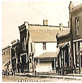
Downtown Lake Orion