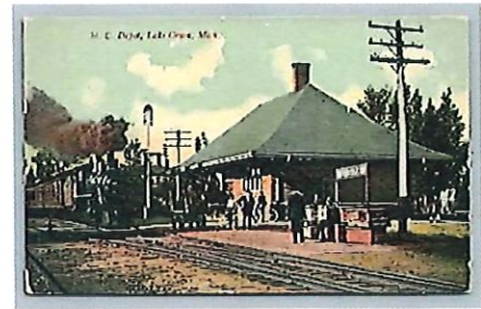
Inter Urban Depot on Broadway

Folks came out from Detroit by the Inter Urban rail line on Memorial Day, opened their cabins or rented a house or a room for a week or two. Dad took the train back to Detroit and work and came out on the weekends. By Labor Day, the cabin was closed, and the whole family moved back to Detroit. The resort heydays were from the 1880s to the late 1920s.