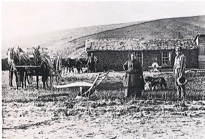
A typical farm family in the 1830s in the Orion area