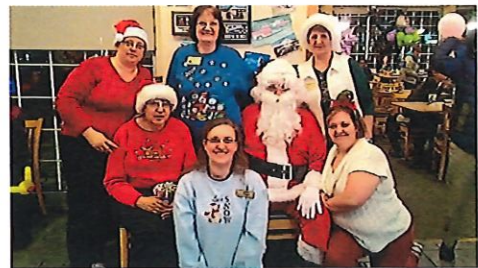
Christmas Fun & Fundraiser

The scrapbooking weekend held at the Lions Bear Lake Camp in Lapeer is a popular event that provides funds for much of the Lioness’s charities. And the Christmas Fun & Fundraiser at a local restaurant helps the members get ready for their holiday project which usually helps the seniors in the Orion area.