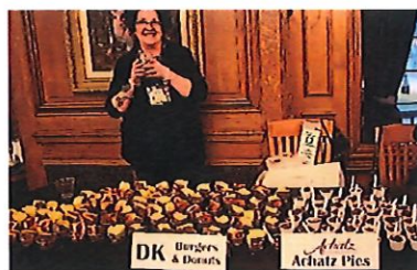
Taste of the Town