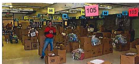
baskets full of food & gifts