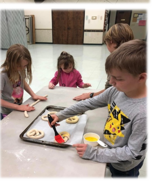
Spring Fun & Placemats for Meals On Wheels

At the end of March, the Buttercups gathered for a time of creating placemats for Meals on Wheels and then to enjoy a beautiful spring day of play with homemade slushies! It was a great time!