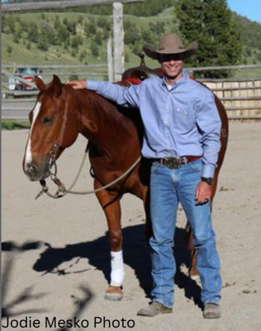
Jodie Mesko Photo