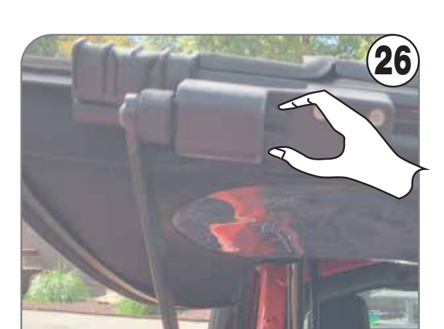
Press the end to release the support bar then roll back and secure with velcro strap