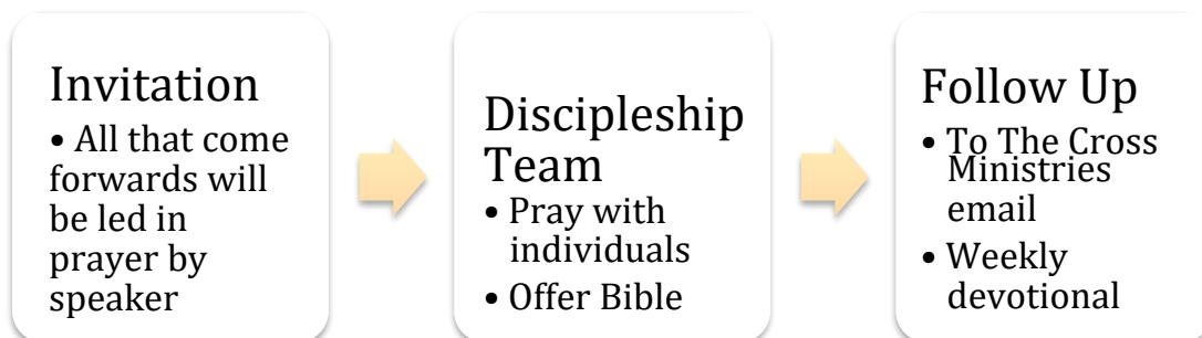
Fig 3.6 - Pursue Process

We will encourage, but not force, the new believer to give their contact information, so that To The Cross Ministries can keep in touch with them. Over the following week they will receive an email congratulating them on the decision and reminding them to get involved in a local church. They will also be added to the To The Cross Ministries email list, which sends out weekly devotionals that are designed to help people follow Christ.