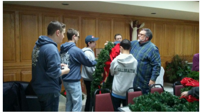
Picture from Christmas 2018: Here you see Troop 50 Boy Scouts helping with one of their favorite service projects, decorating Holy Name Church for Christmas. Thanks to the Boy Scouts and all who help decorate each year.