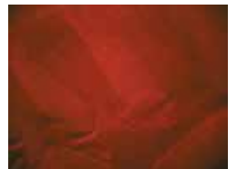
WINE RED (BLACK BASE)