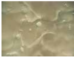
BLONDE (BLACK BASE)