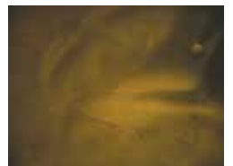
BARK BROWN (BLACK BASE)

Note: Color samples on this chart represent the color of the metallic on top of a black pigmented epoxy. Suggested pigmented epoxy bases can be either Dura-Kote Pigmented Water Based Epoxy or Dura-Kote Pigmented Epoxy 100. Changing the base color can be done, when this is option chosen create a sample for accurate approval of finished floor design. Metallics flow organically within the Dura-Kote Epoxy 100 Clear Coat, elevation or pitch changes in a floor will cause unpredictable movement. Final color design can have variations due to methods of application by applicator. SureCrete recommends making final selection from job specific samples made in the field.