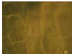
TOFFEE (BLACK BASE)