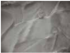
GUN METAL (BLACK BASE)