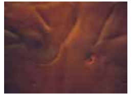
DARK CHERRY (BLACK BASE)