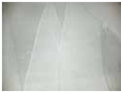
PEARL (BLACK BASE)