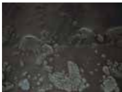
CHARCOAL (BLACK BASE)