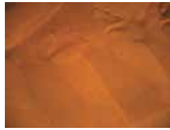
BURNT ORANGE (BLACK BASE)