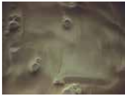
PEWTER (BLACK BASE)