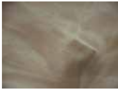
CHAMPAGNE (BLACK BASE)