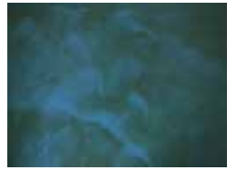
MIDNIGHT BLUE (BLACK BASE)