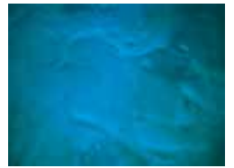
ROYAL BLUE (BLACK BASE)