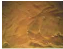
BRASS (BLACK BASE)