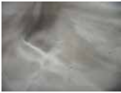
SLATE (BLACK BASE)