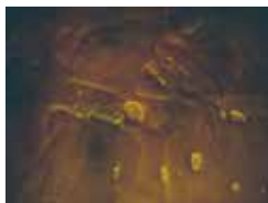
SEQUOIA (BLACK BASE)