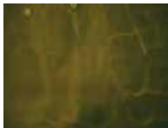
BRONZE (BLACK BASE)