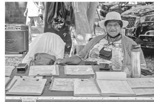
A board member of the Rosenwald School restoration initiative and a former student mans a table with information on the effort at the cleanup.