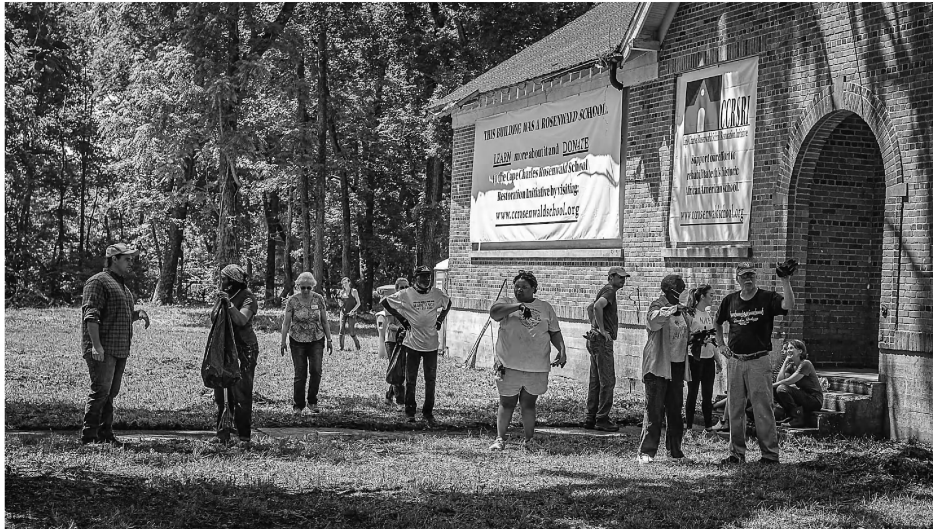
As part of the Chesapeake Bay Foundation's "Clean The Bay Day" the Cape Charles Rosenwald Restoration Initiative had a crew working to clean up at the abandoned Rosenwald School in Cape Charles. The volunteer crew picked up trash, cleared brush and did maintenance work around the school. The group has plans to transform the building into a multi-use community space.