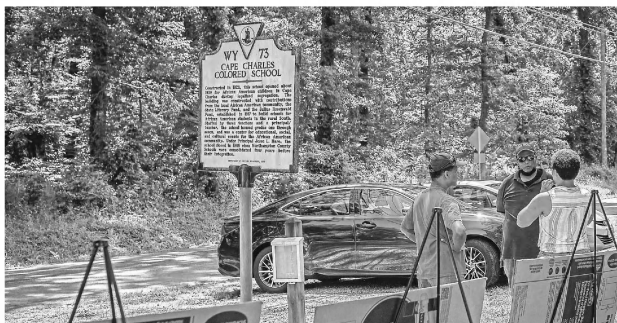
The Commonwealth Historical Marker highlights the role the old Rosenwald School played in the area's history.