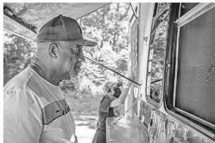
A volunteer orders from Gordo's Taco Truck which showed to offer lunch to the group that help clean up at Rosenwald School in Cape Charles.