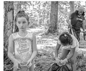
Young volunteers help with trash removal at the Rosenwald School cleanup in Cape Charles.