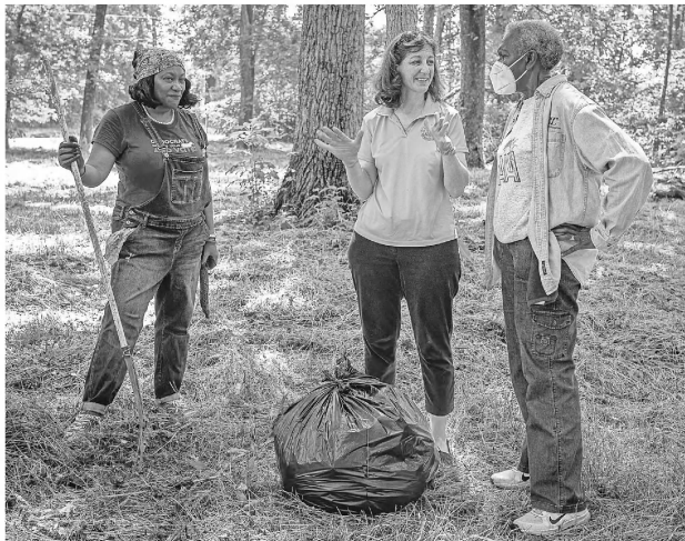
Congresswoman Elaine Luria showed up at the Rosenwald School site to help with the clean-up that was held to coincide with the Chesapeake Bay Foundation's Clean the Bay Day on June 5.