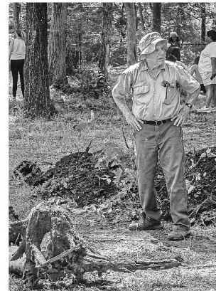
A volunteer contemplates the heavy work ahead of them during the Rosenwald School cleanup.