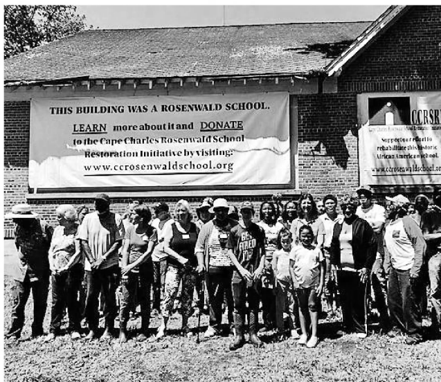
Volunteers with the Cape Charles Rosenwald School Restoration Initiative stand outside the building in Cape Charles.