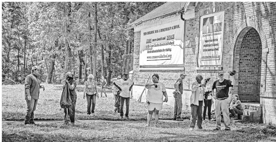
As part of the Chesapeake Bay Foundation's "Clean The Bay Day" in June, the Cape Charles Rosenwald Restoration Initiative had a crew working to clean up at the abandoned Rosenwald School in Cape Charles. The volunteer crew picked up trash, cleared brush and did maintenance work around the school. The group has plans to transform the building into a multi-use community space.