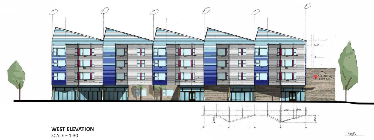
WEST ELEVATION SCALE = 1:30