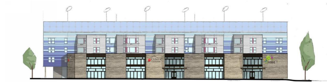
SOUTH ELEVATION SCALE = 1:30