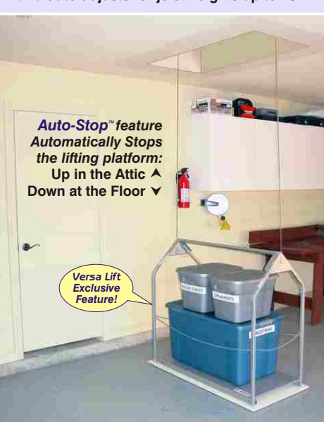
Versa Lift's steel platform frame adds stability, while it defines & protects the cargo space.