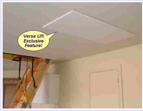
Versa Lift Auto-Close™ seals the ceiling opening and auto-adjusts for joist heights up to 18".