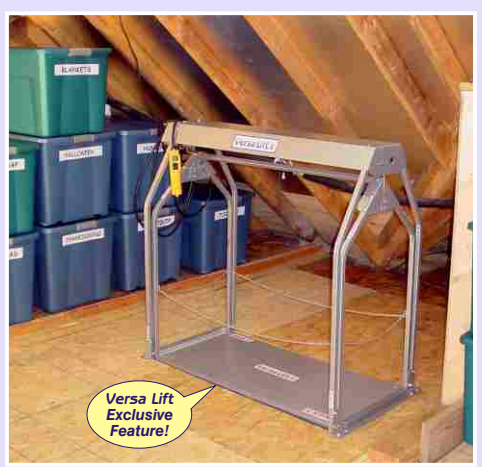
Versa Lift Level-Up™ feature brings the platform flush to attic floor, so cargo slides on and off!

(Common to All Models) 18" (for Auto-Close<sup>™</sup> Feature) 8" per sec (8-ft in 12 sec) Cables (x 2): .093 steel - 1,000-lb break each 110 volt AC, 60hz, 4.5 amp Voltage: (*Note: Model 24S is same as Model 24, except 12" shorter)