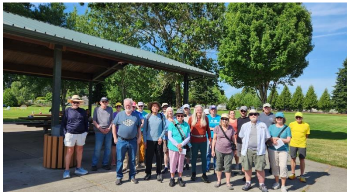
Wed Walkers –Felida 24 Jun 2026