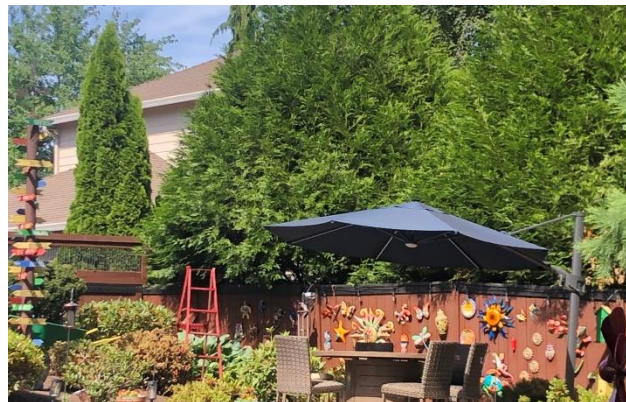
Find the Butterfly OTSVA 2026 Challenge –Felida Walk - 24 June 2026