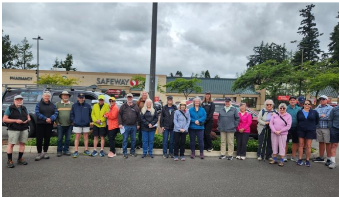
Wed Walkers –Butler Creek - 10 Jun 2026