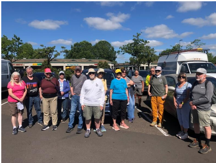
Wed Walkers – Wilsonville 17 Jun 2026