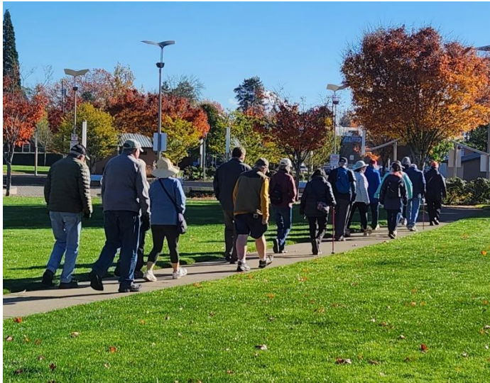
5km walkers in Gresham- 6 Nov 2024

New Seasons Market (Outdoor Patio) 1214 SE Tacoma St