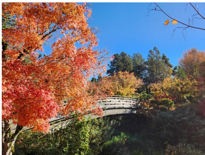
Japanese Garden – End of Gresham City Walk -6 Nov

Easy Walk on the Sumner Link Trail along the White River. This will be an out-and-back route. 5 and 10 km rated 1A (easy)