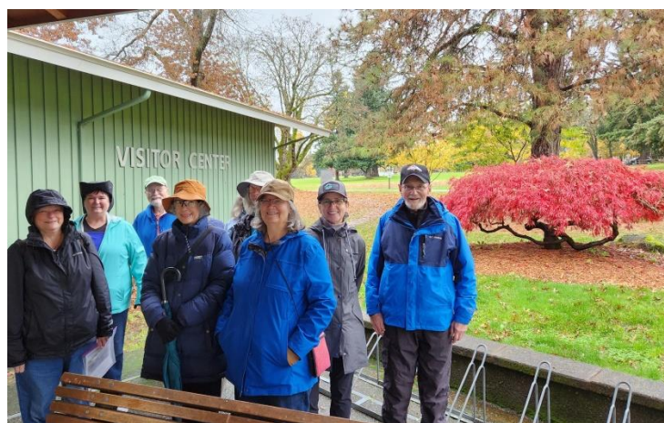
Wed Walkers @ Ft Vancouver Visitor Center – 13 Nov 2024

Walk in residential districts and into beautiful Laurelhurst Park. Walk continues along Hawthorne Blvd. with unique shops, exotic restaurants and interesting people. Walk this day will highlight Peacock Lane known for their Christmas Decorations. Lights on Peacock Ln start at 6PM RECOMMEND YOU BRING A FLASHLIGHT 5 and 10 km rated 1A (easy)