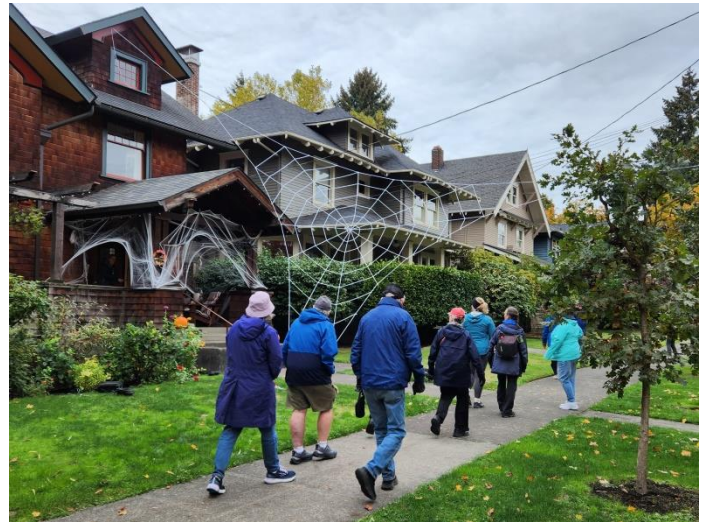
5km walkers passing Halloween decorations

Celebrate New Year's Day in the morning walking with a choice of 3 different 5 km routes and one 6k routes. The NW Loop (rated 1B) will be in older nice residential areas and in a small wooded park with dirt trail. The NE Loop (rated 1A -6km) is on paved pathways near and in residential areas. The SE Loop (rated 1A) will mainly be in Pacific Community Park on paved or gravel trails and the SW Loop (rated 1A) will be in a newer area with some very nice homes. There will be random prizes of Champagne and Sparkling Cider awarded to some walkers.