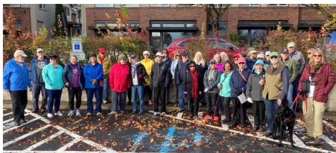
Wed Walkers @ Lake Oswego Start – 20 Nov 2024

Walk on sidewalks, boardwalks and well-groomed trails along the waterfront, through the Capitol Campus, neighborhoods and the Farmer's Market. Pets are not allowed in the Farmer's Market but can walk around the outside of it.