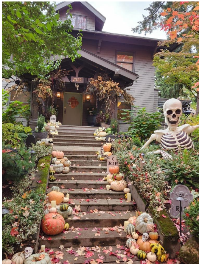
Halloween Decorations on the Historic Irvington

Safeway (North end), 5660 Commercial St SE