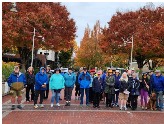
Walkers at start of Historic Irvington Walk – 30 Oct

South East Salem– (Event) The walk is primarily in attractive newer residential areas. There is new commercial developments on Kuebler which the routes will pass by. 5 rated 1A (easy) & 10 km rated 2A (Moderate)