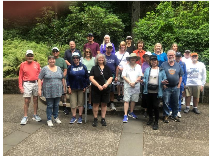
Wed Walkers – The Grotto 20 Aug 2025

This walk starts near the Willamette River, near a nice covered picnic area with Some paved and dirt trails passing by two small lakes and some wetland areas. 5 and 10 km rated 1A (easy)