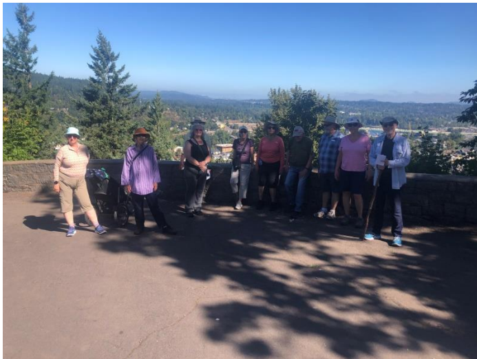
5km Walkers at Oregon City overlook – 13 Aug 2025