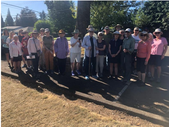
Wed Walkers – Oregon City - 13 August 2025

This quaint town comes alive with brews, brats, German music (oompah) and crafts for this annual event. The walk takes you through the craft fair, past the Glockenspiel and up the hill to the Abbey. 5 km (1A) 10 km (2A)