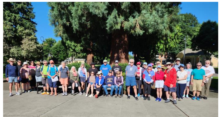
Group walkers at the 4th of July Walk

Two 5 km loops: The first loop will leave The Grotto and walk in nice neighborhoods in the Rose City neighborhood. The second loop will go thru The Grotto and City of Maywood Park. 5 and 10 km rated 1A