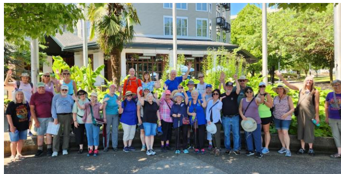
29 - 5 km walkers on the 5 –T walk – 20 Jun 2024

Walk along the Columbia River and in Ft Vancouver crossing over the Lewis and Clark Centennial Land Bridge 5 km rated 1A (easy)