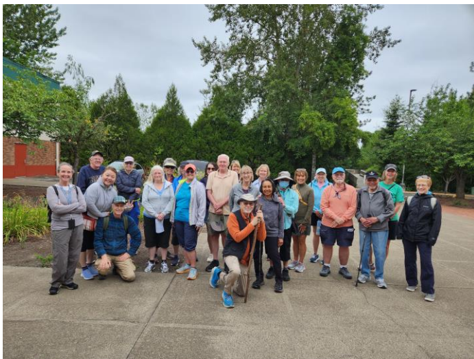
Wed Walkers at Ice Age Trail. Tualatin – 3 July 2024