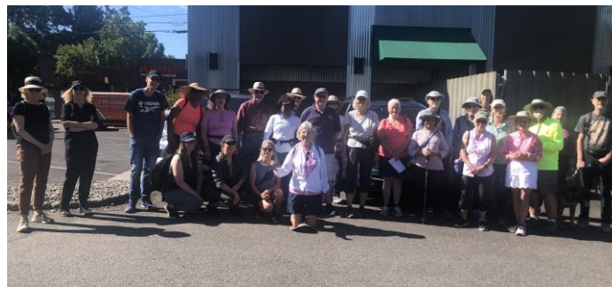
Start Sellwood Bridge Walk – 24 July 2024