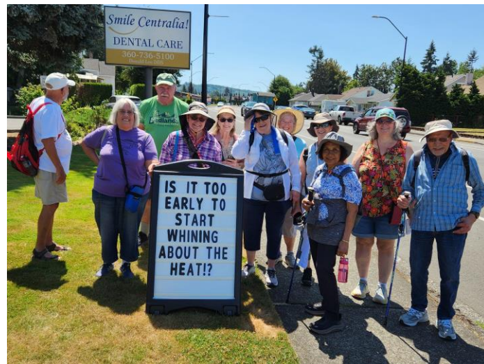
5km walkers at Centralia – Train trip