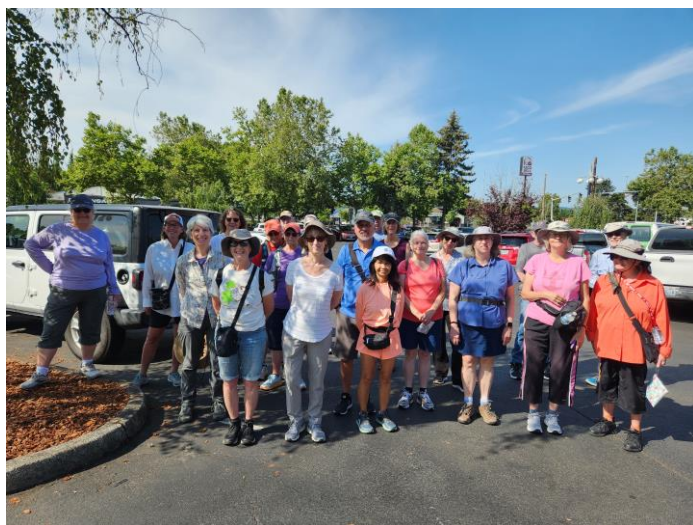
Wed Walkers at Hayden Island – 17 July 2024

Explore evolving Ballard: craftsman homes to condos/apartments, retail core to restaurant row, craft breweries and coffee shops, Ballard Commons, and, of course, the Chittenden Locks. 5 and 10 km rated 1A (easy)