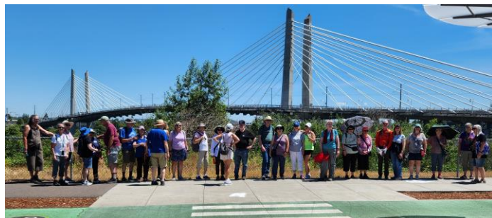
5 km walkers posing at Tilikum Bridge 20 Jun 2024