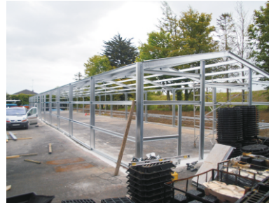
STRUCTURE 160FT X 30FT X 12FT DROGHEDA CO LOUTH