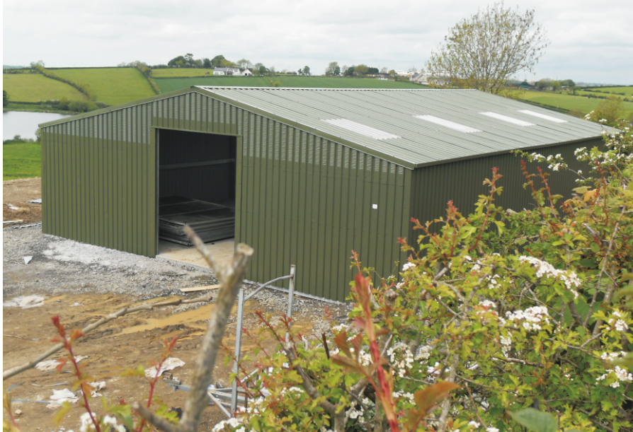
STABLE BLOCK IN BANBRIDGE