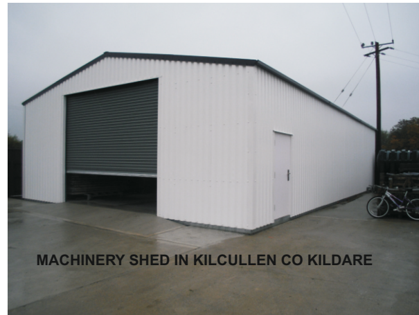
MACHINERY SHED IN KILCULLEN CO KILDARE

QUALITY STEEL BUILDINGS 10 LETALIAN ROAD KILCOO, NEWRY, CO DOWN BT345EY