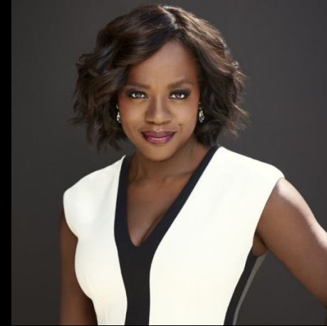
Viola Davis CEO, JuVee Productions