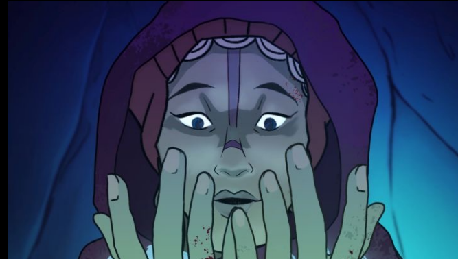
MINE (2D animated series) USA