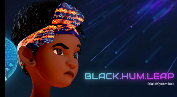
BLACK.HUM.LEAP (VR episodic series) Spain