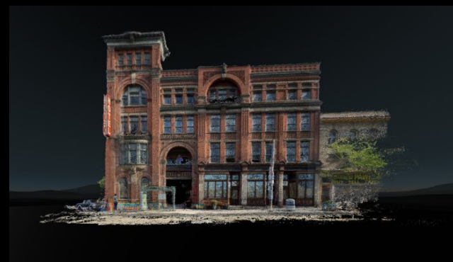
OUR HOME AND HAUNTED LAND (AR site-specific experience) Canada