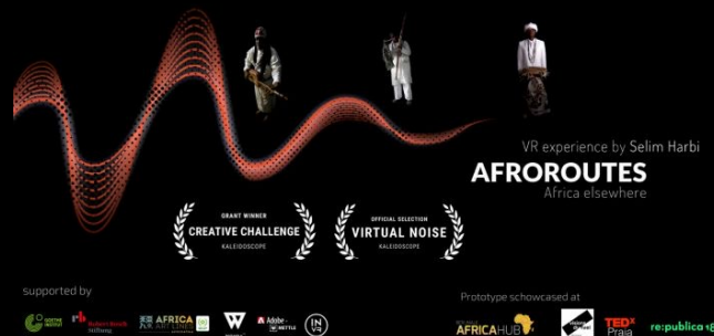
AFROROUTES (360VR documentary film) Tunisia