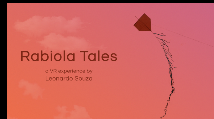
Rabiola Tales (VR project) Brazil