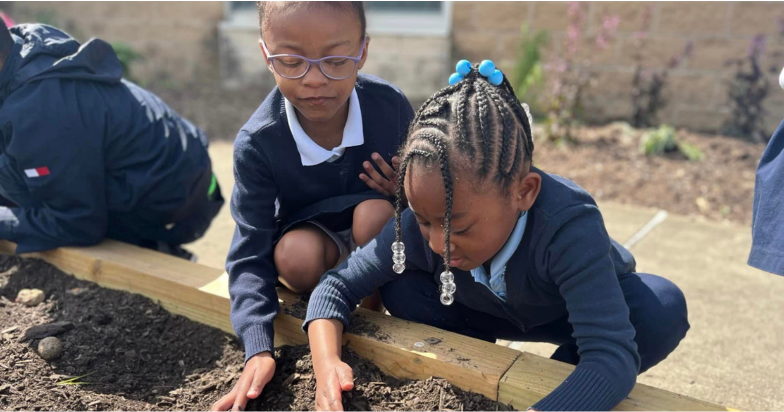
BERWICK STUDENTS GETTING THEIR HANDS DIRTY AND PLANTING POTATOES