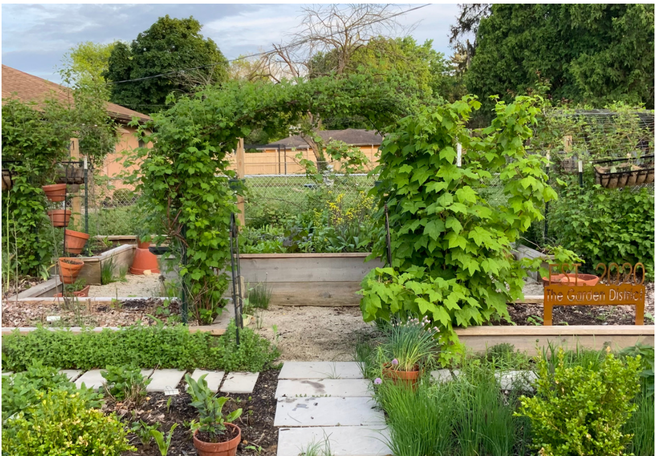
ENTRANCE INTO THE EDUCATIONAL DEMONSTRATION PERMACULTURE FOOD FOREST

On site is our administrative office and a germination station with 32 grow lights, starting more than 75% of our plants in the spring. Attached to the food forest is a perennial cut flower garden with over 1400 spring bulbs, summer, and fall perennials. Over 1000 of the cut flowers were donated to residents at Wexner Heritage Village, a partner organization for the past 3 years.