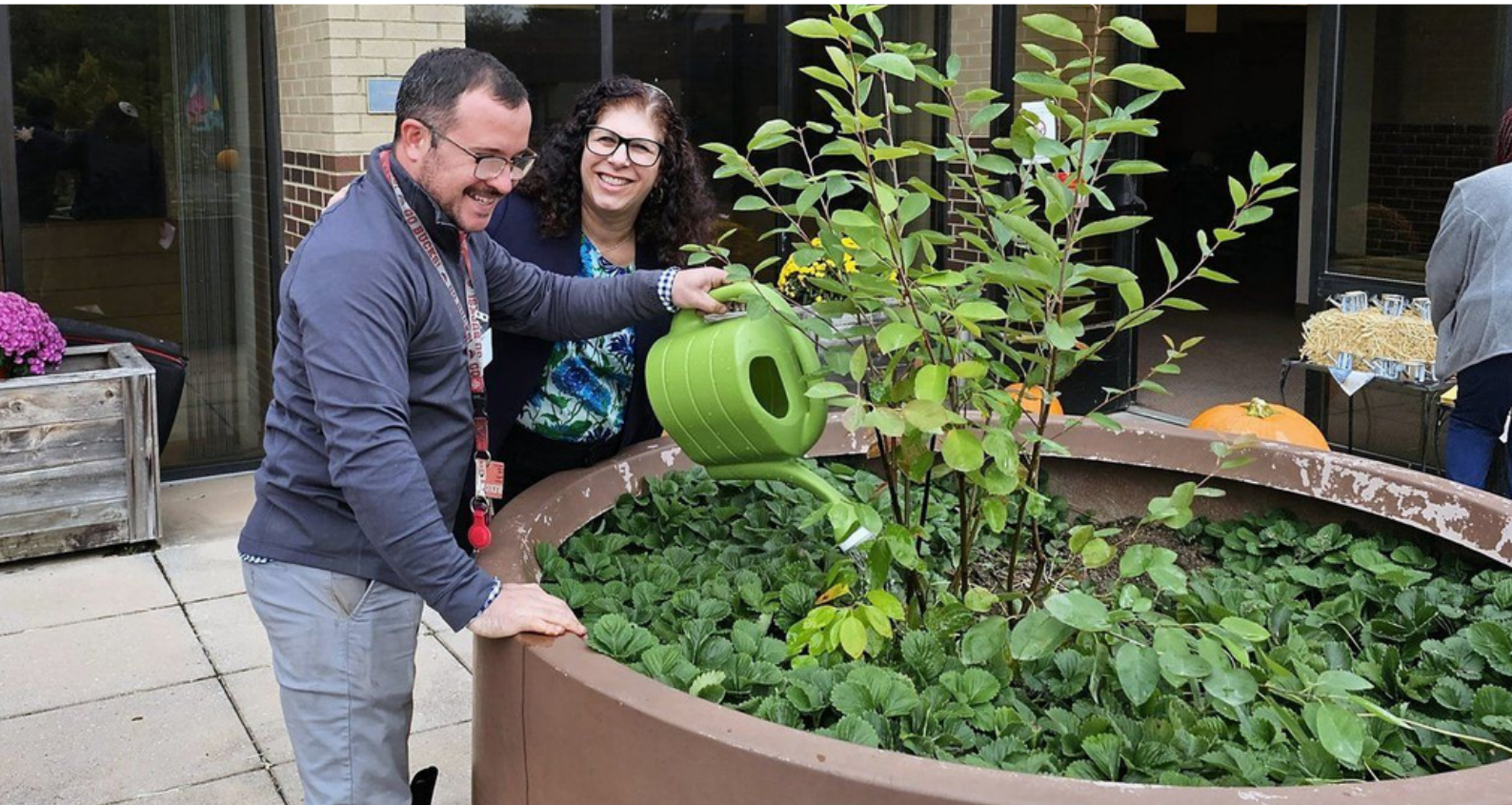
NATIVE TREE PLANTING TO CELEBRATE THE VOLUNTEERS OF WEXNER HERITAGE VILLAGE

The WHV rooftop garden now offers a place for outdoor respite for WHV residents, visitors, and staff. The garden yields plentiful weekly harvests of vegetables, herbs, and flowers. The bounty is shared with WHV staff and partnered with Jewish Family Services, another community agency that distributes the fresh produce to Holocaust survivors, refugees new to Columbus and other clients that are experiencing food insecurity. Together we have cultivated so much more than a garden. We created a place of beauty where nature provides healing and rejuvenation. In addition, we helped our seniors reengage with community volunteers and experience renewed purpose through the meaningful work of cultivating a garden that nourishes the mind, body, and spirit of those facing food insecurity in our own backyard.