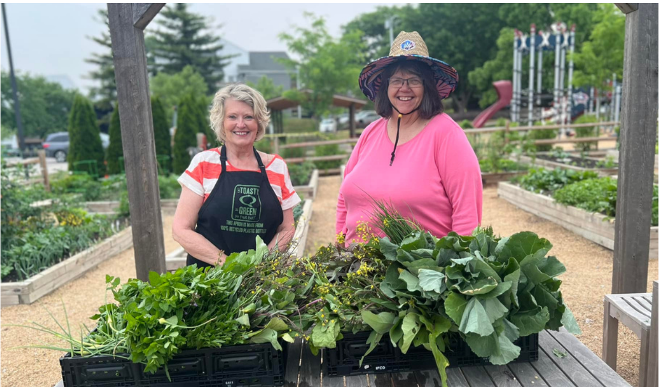
MONDAY WORKDAYS AT SOUTH BEXLEY COMMUNITY GARDEN

Although, South Bexley Community Gardens (SOBEX) are an annually-leased style garden, they provide specific beds that are allocated as ‘giving gardens’ to help supplement food pantries. The gardens are part of the City of Bexley Recreation and Parks Department and are open for anyone to join. This is the second year The Garden District has been leading the initiative since 2021.