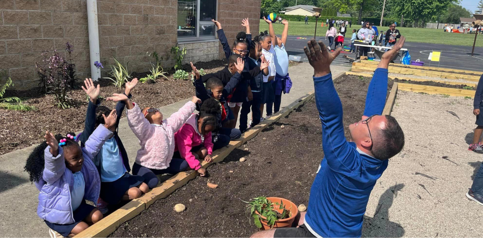
STUDENTS PLANTING POTATOES REACHING UP TO THE SUN TO GROW BIGGER