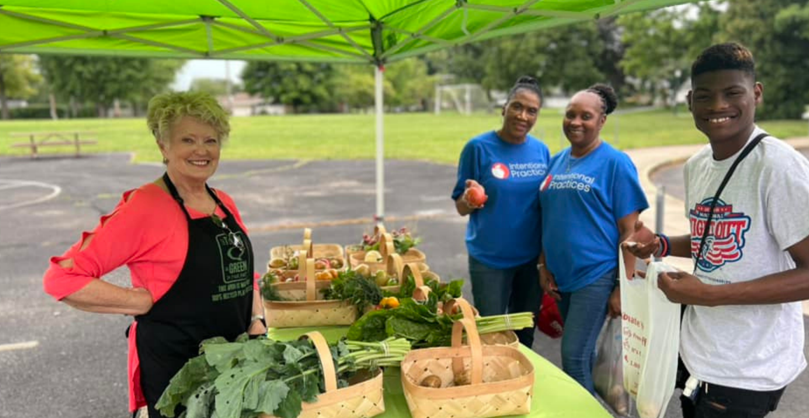
OUR FREE FARMSTAND WITH STAFF AND STUDENTS TAKING HOME SOME GOODIES