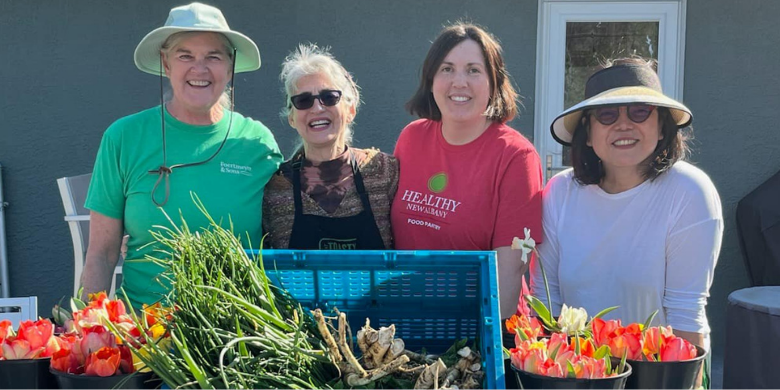
SPRING WORKDAY WITH SOME NEW VOLUNTEERS