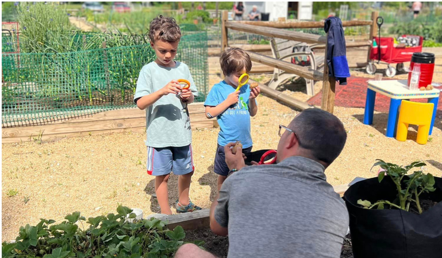
CHILDREN GARDEN CLUB PARTICIPANTS LOOKING AT THE EYES OF A POTATO