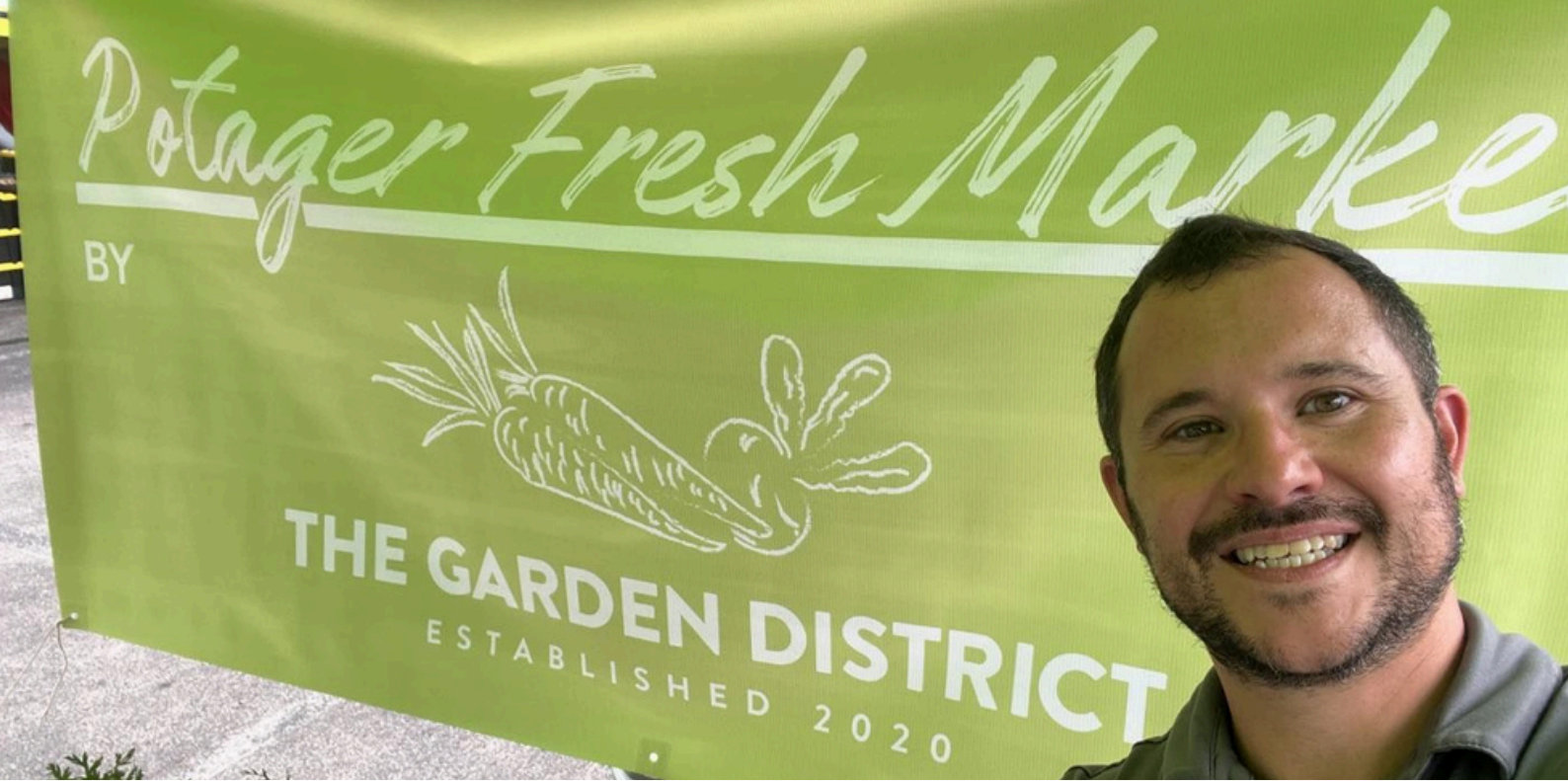
NEW MARKETING BANNER FOR THE POTAGER FRESH MARKET BOOTH