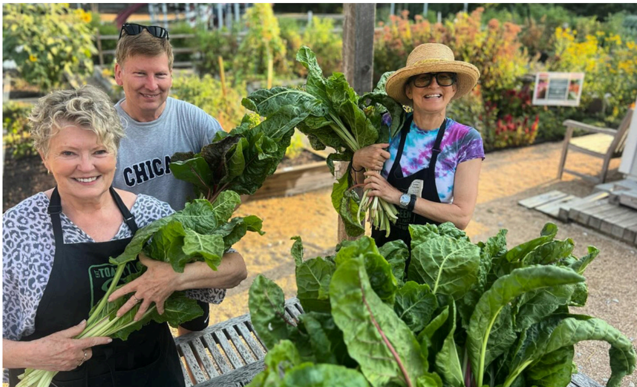
MONDAY WORKDAYS AT SOUTH BEXLEY COMMUNITY GARDEN

Every Monday morning, our dedicated team plants, weeds, waters, harvests, and processes produce grown in the gardens. This year, we successfully donated 687.9 lbs. of fresh fruits and vegetables to the LSS Food Pantry.