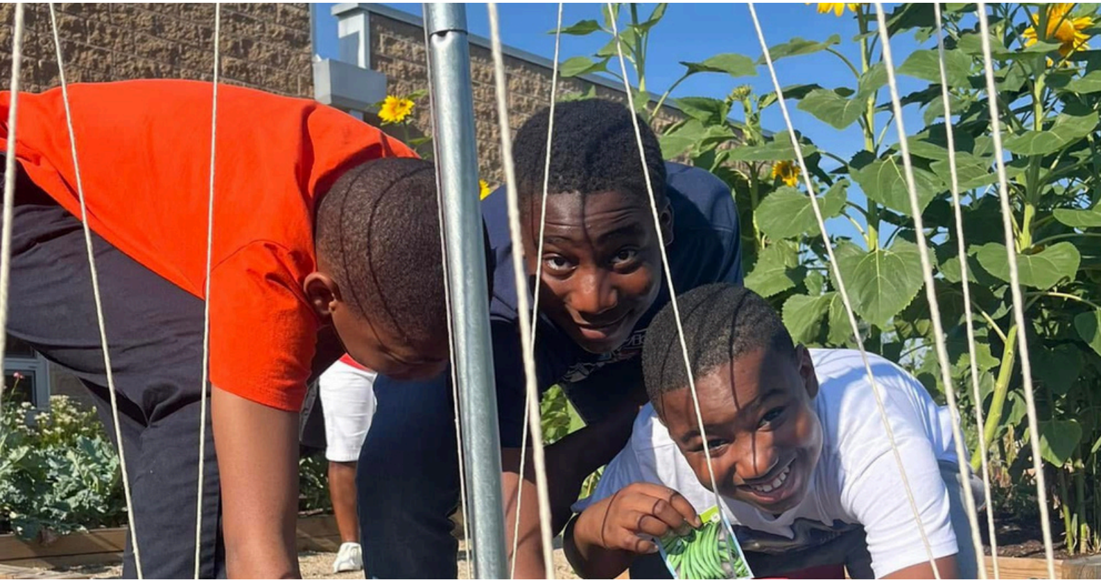
BERWICK STUDENTS GETTING THEIR HANDS DIRTY AND PLANTING POLE BEANS