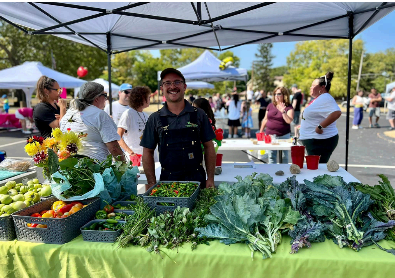
FREE FARM STAND AT THE 2024 SWEET AS HONEY APPLE FESTIVAL