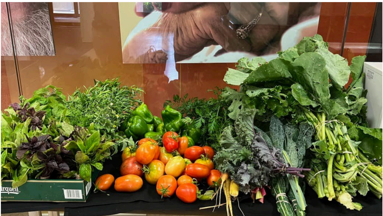
HARVESTS FROM THE ROOFTOP GARDEN FOR RESIDENTS, STAFF, AND FAMILY