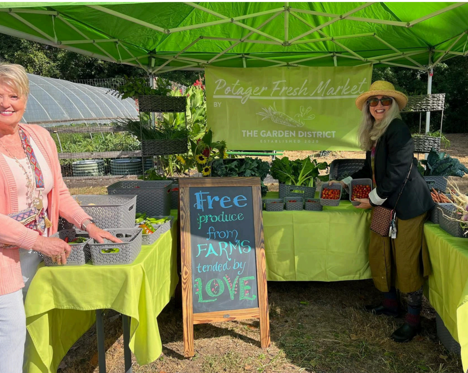
FREE FARM STAND AFTER SERVICE AT LIFE VINEYARD CHURCH

The community farm at LIFE Vineyard Church, located at 620 Alum Creek Drive, has been transformed from an abandoned garden into a vibrant agricultural hub. After five years of neglect, we renovated the site, removing invasive plants and enriching the soil with 25 yards of Zoo Brew compost from Price Organics Farm and all-newly installed raised beds purchased from the Franklin County Urban Agricultural Infrastructure Grant.