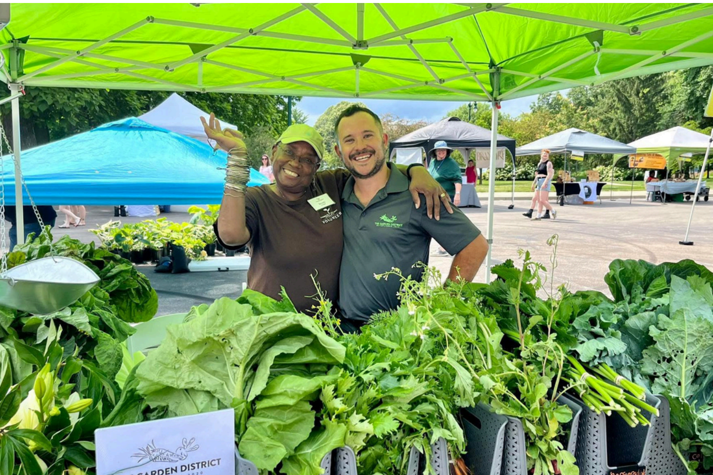
VOLUNTEERING AT THE POTAGER FRESH MARKET STAND AT FRANKLIN PARK CONSERVATORY

We Grow helps citizens of the Near East Side (NES) grow food for their community by sponsoring, teaching, and advising amateur growers from seed to market. Our goal is to create a fair and sustainable food system within the NES where nutritious food is readily available and fairly priced. We believe by joining together to build relationships with our food, we can help the Near East Side gain food sovereignty and lift up a healthier community.