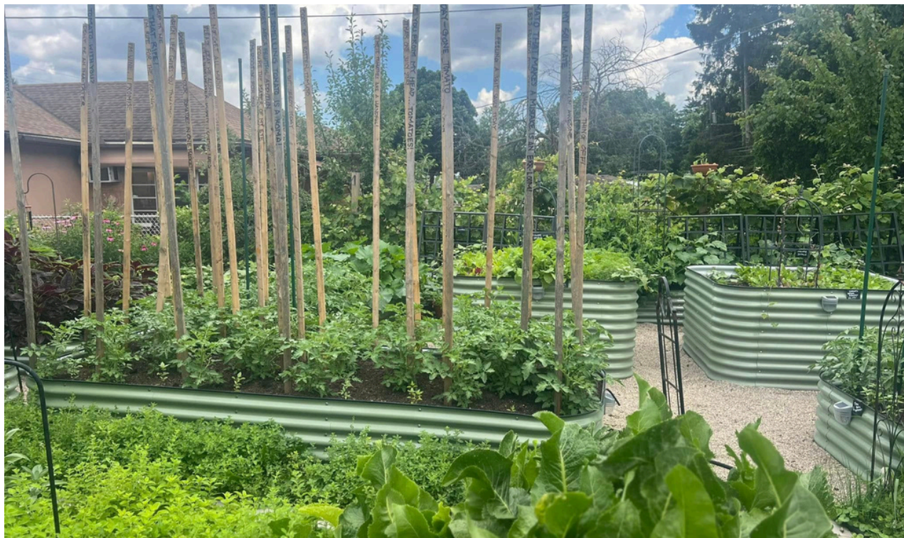
RAISED BEDS INSTALLED FUNDED BY THE URBAN AG INFRASTRUCTURE GRANT

Our headquarters also houses our administrative office and a state-of-the-art germination station with 56 grow lights, enabling us to start more than 85% of our plants each spring. Additionally, we installed three Microgreen production towers later in the growing season, allowing us to cultivate nutritious microgreens that further enhance our pantry offerings and extend our growing season. This ongoing development underscores our commitment to sustainable practices and community nourishment.