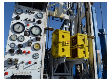
PipeRunner™ Iron Roughneck