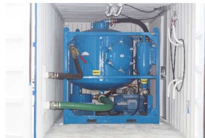
Triton Environmental Vac-Pak™