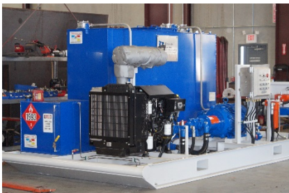
Star™ Drilling Rig HPU