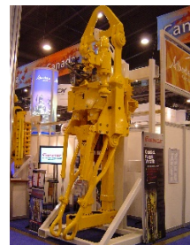
Foremost Top Drive