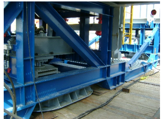
RigRunner™ Walking System