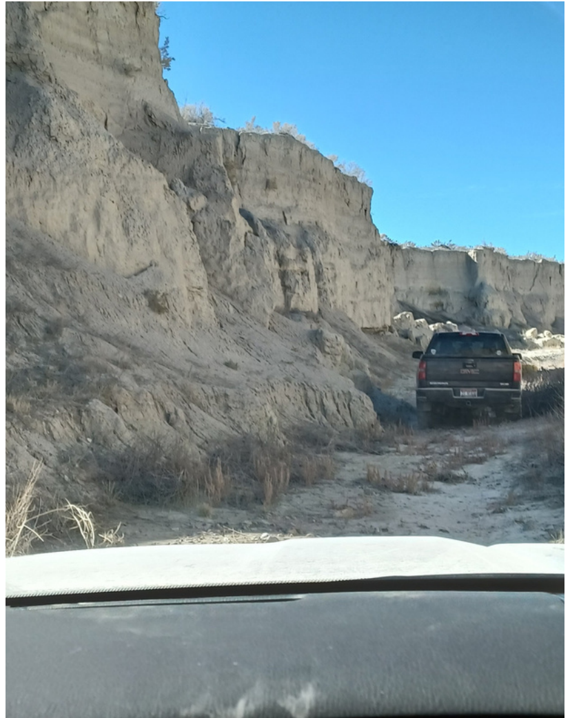
You can see in the photos provided, they searched mines and washes for any sign of Dylan or clues to what happened. MOB Crew flew drones and a group of cadaver dogs were out searching as well.