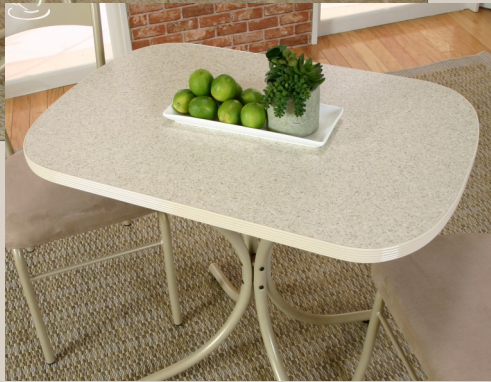
(2) Mocha/ Cappuccino Microsuède Chairs (18 x 21 x 38)