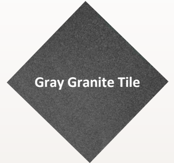
Gray Granite Tile