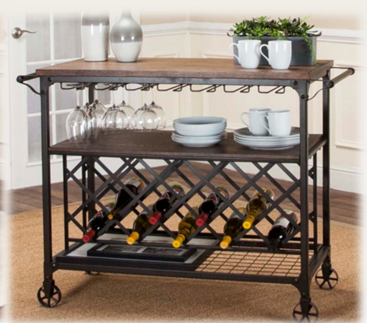
CR-W3075-78 -Coffee Metal/Rustic Elm Serving Cart (40x20x36)