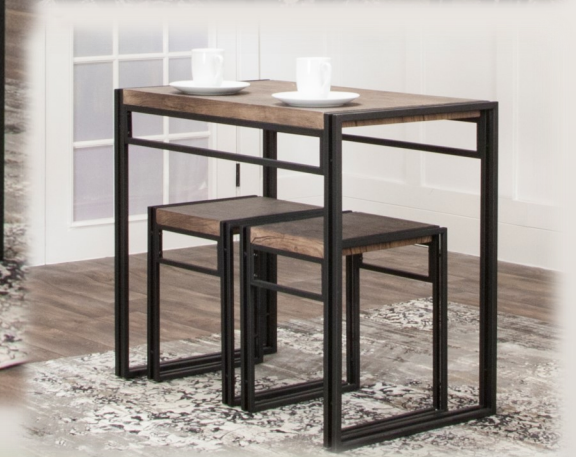
CR-P2089-75 Dawn Reclaimed Oak 3 Piece Set