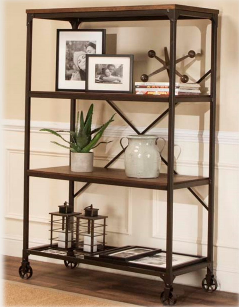
Wide Bookcase CR-W3075-88 Rustic Elm/Coffee Metal (40 x 18 x 63)