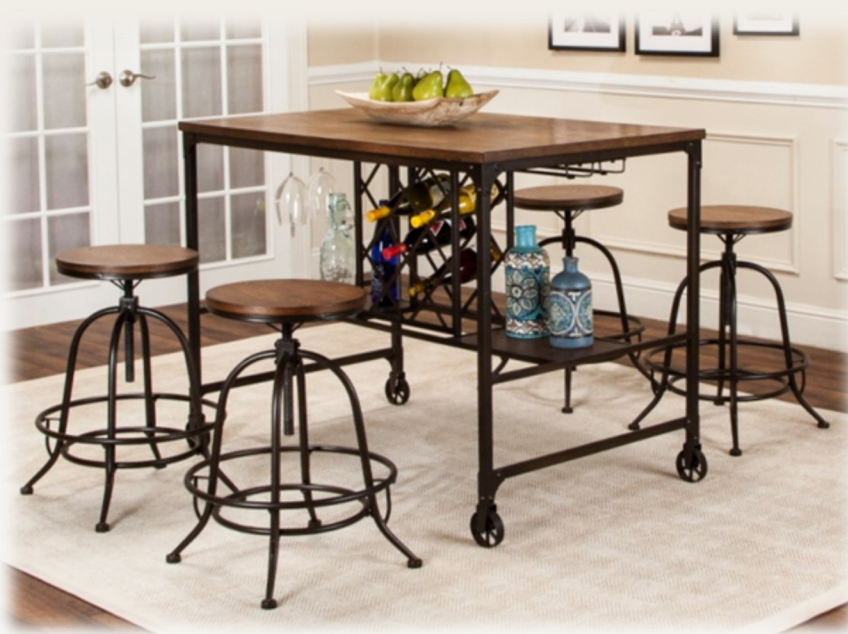
CR-W3075-68 Rustic Elm Counter Height Table (48 x 30 x 36)