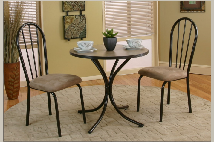
CR-D8009-59 30" Round Beige Linen Laminate Table