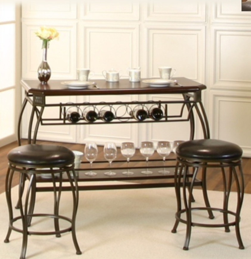
WARNER 3pc set CR-Y2798-75 24" Wood Veneer Bar & Stools (48.75 x 21 x 36.5)