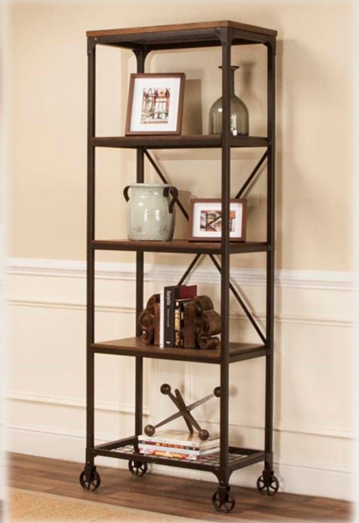
Narrow Bookcase CR-W3075-87 Rustic Elm/Coffee Metal (26 x 15 x 74)