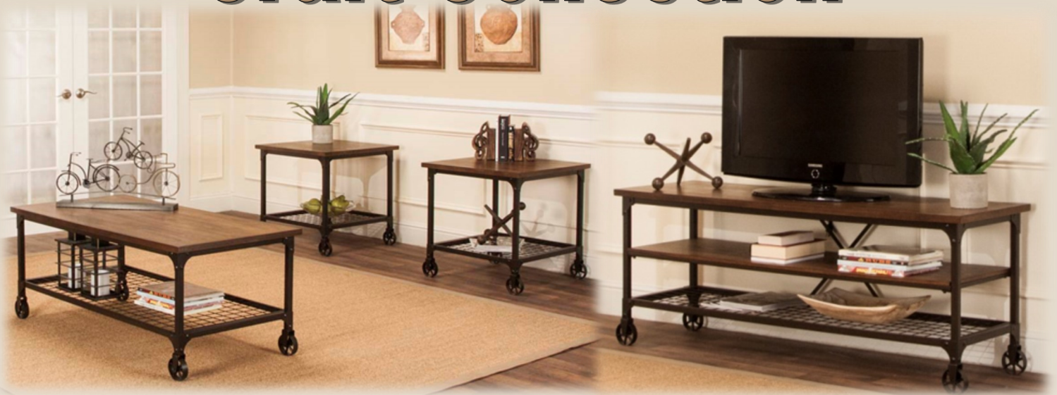
3PK Occasional Tables CR-W3075-90 Rustic Elm/Coffee (1) 48 x 24 x 20 / (2) 24 x 24 x 24