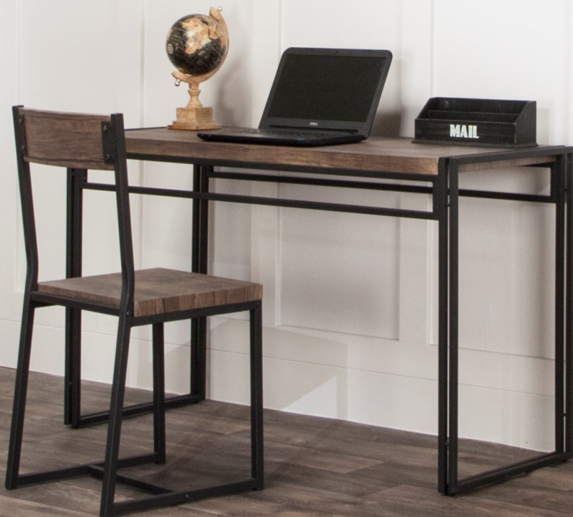
CR-P2089-74 Dawn Reclaimed Oak Desk and Chair Set