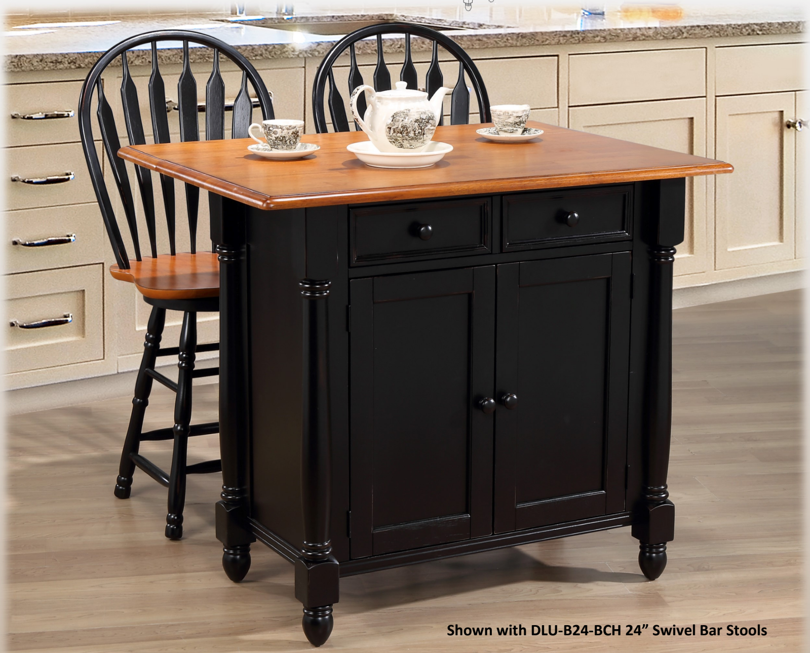
Shown with DLU-B24-BCH 24" Swivel Bar Stools