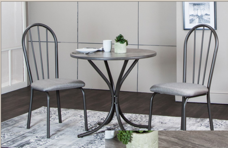
CR-D8719-59 30" Round Vintage Laminate Top Table