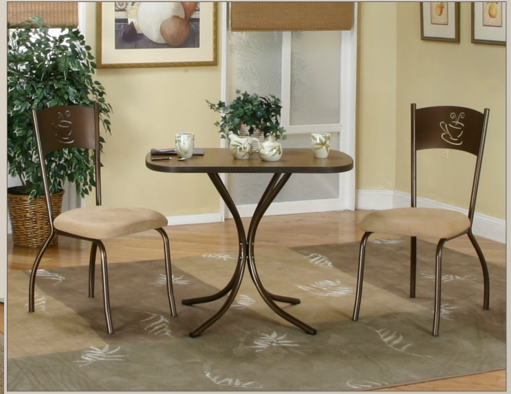
CR-D8272-65 Laminate Table (36 x 24 x 28)