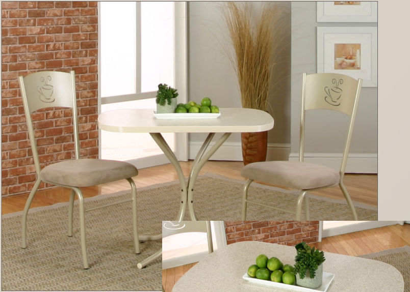
CR-D8466-70 Laminate Table (36 x 24 x 28)