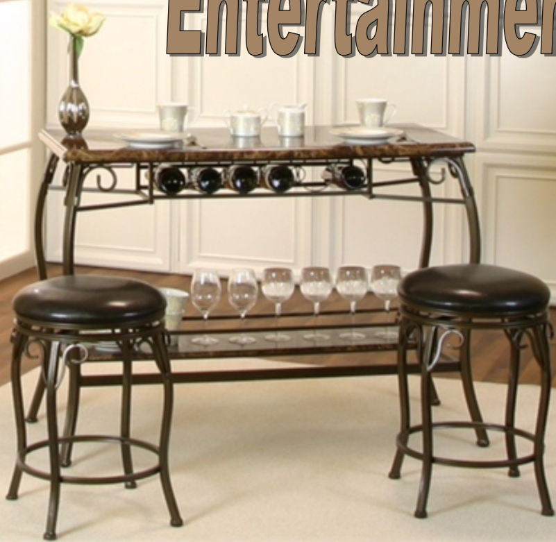
MARQUE 3pc Set CR-Y2443-75 24" Faux Marble Bar & Stools (48.75 x 21 x 36.5)