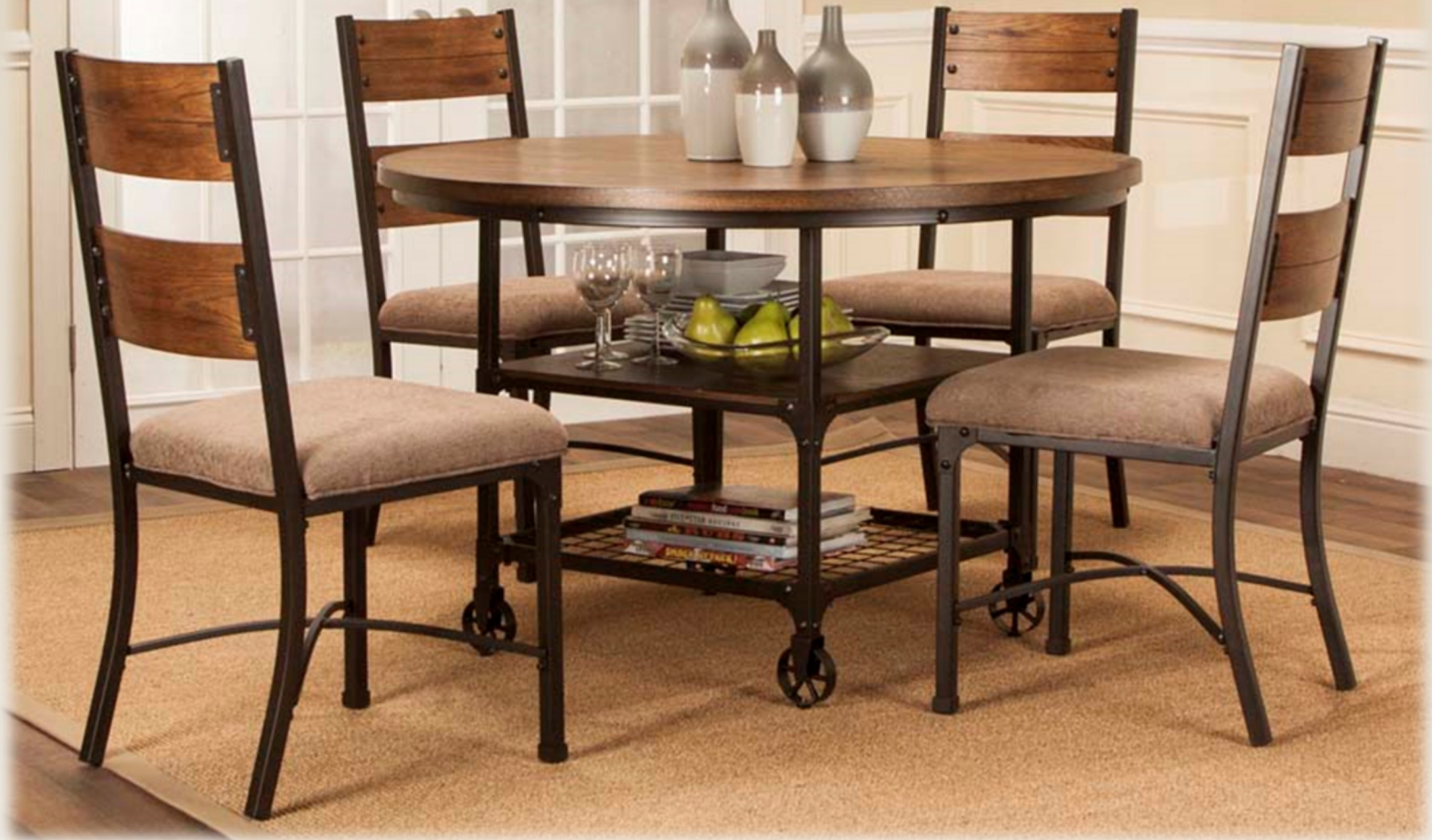
CR-W3075-66 45" Round Rustic Elm Veneer Table