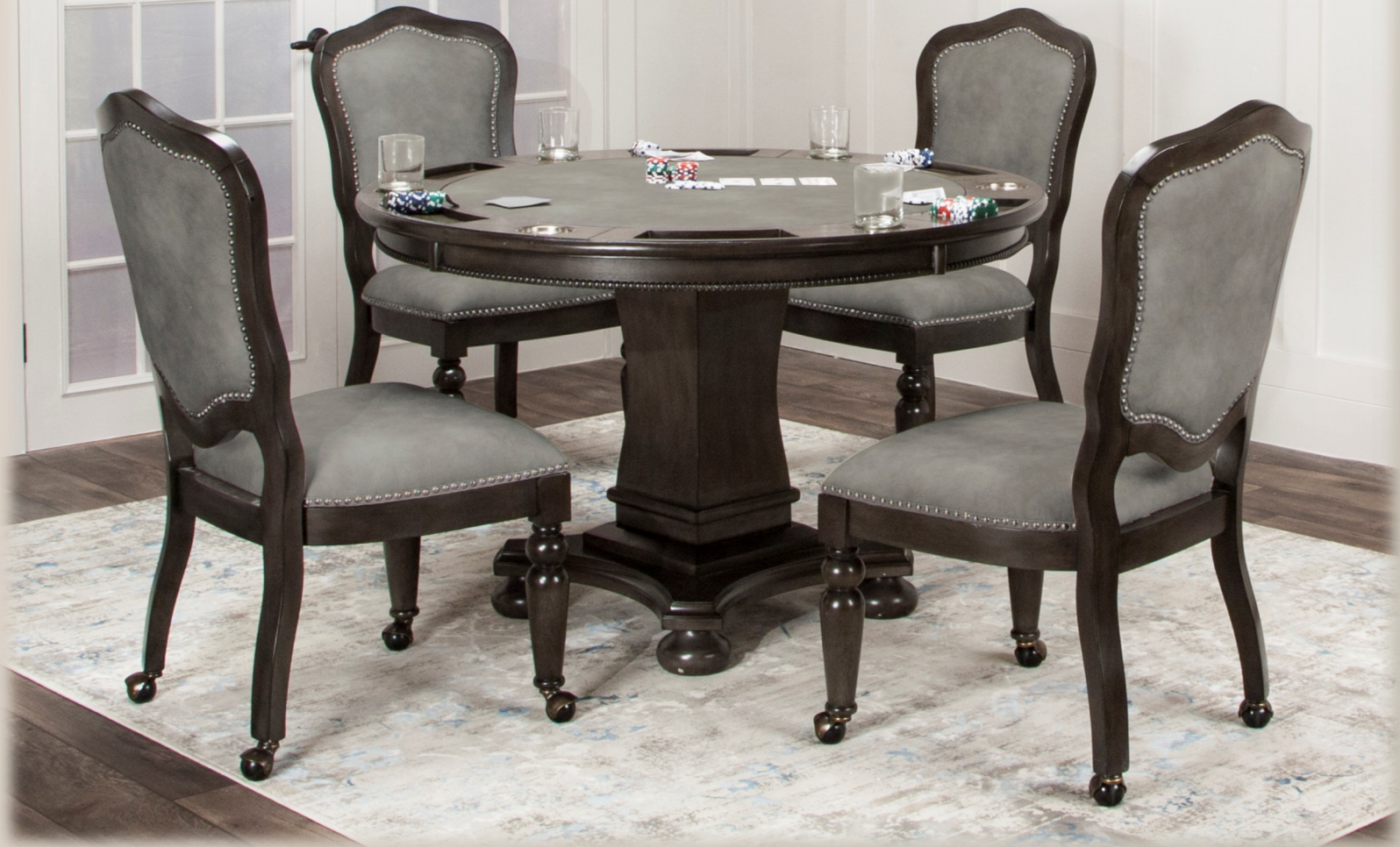
GRAY FARAN GAME TABLE

CR-87711 61/63 Table (48 x 48 x 30) | CR-87711-05-RTA Caster Chair (24 x 21 x 41)