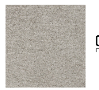
358-80 Wellness Fabric