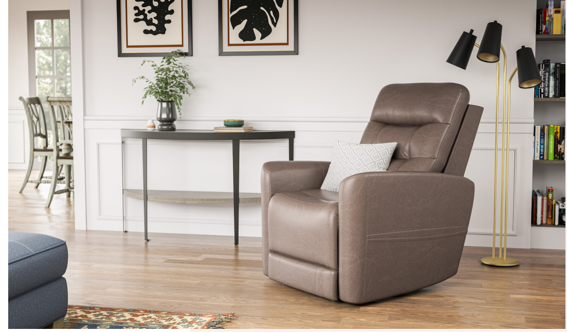
Featured Lift Recliners Top image: Clive Bottom image: Kenner