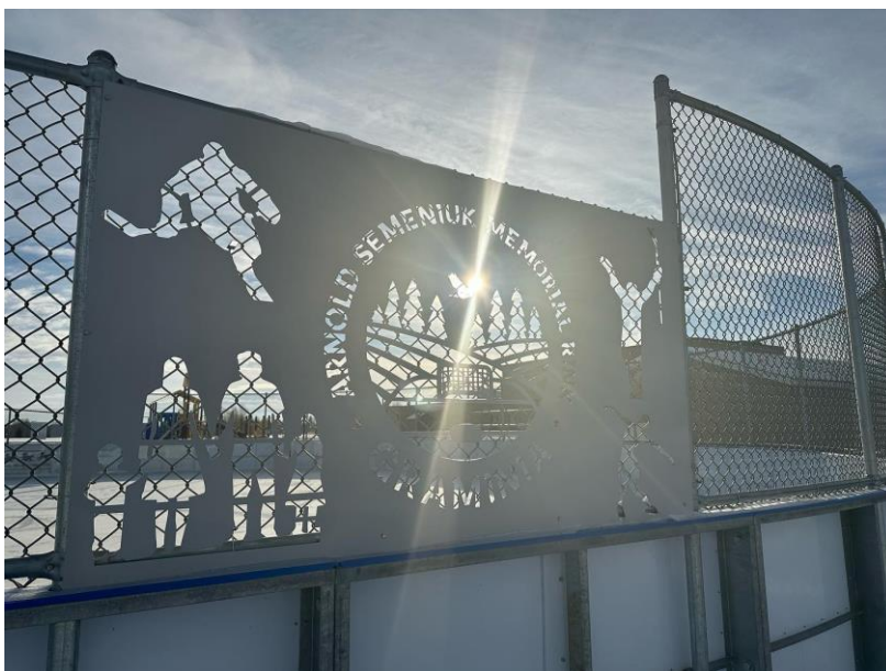
The Arnold Semeniuk Memorial Rink