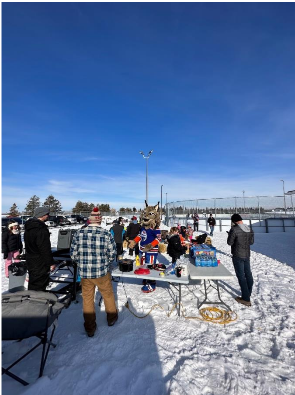
The Graminia Rink Society hosting "Rink Day" 2023

Graminia school or as long-time (3rd and 4th generation) residents of Graminia. The society is now in its second generation of board members. This new generation of leadership brings with it new energy and a renewed excitement for phase two of the rink rebuild project.