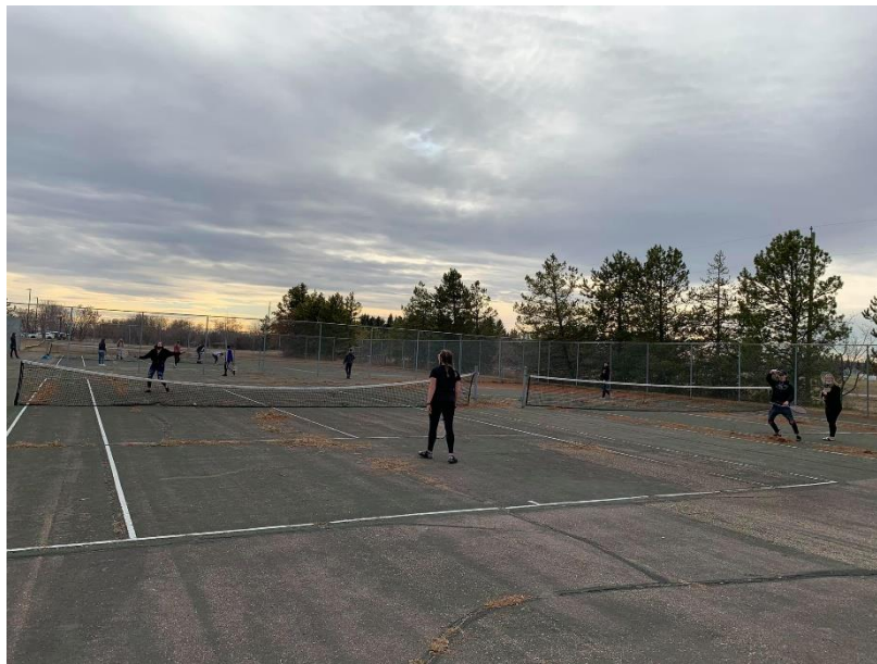
Photograph: Graminia kids & community members engaging in racquet sports on the current tennis courts in need of repair.

As part of our lease agreement with Parkland School Division, the Rink Society agreed to take over responsibility for the four tennis courts adjacent to the rink. The courts are in a similar state of disrepair to the original rink and need immediate refurbishment if they are to continue to serve their purpose in the community. This will be the first project undertaken in phase two. Despite their current condition, the tennis courts see a substantial amount of use from the school and community. Many children in the school participate in racquet sport units in physical education, and the rise in popularity of other racquet sports, such as pickleball, are creating a renewed enthusiasm for the courts within the greater Graminia Community.