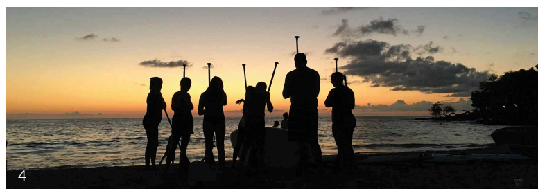
1 Mauna Lani Bay Golf Course. 2 Mauna Kea Beach Hotel (photo by Mauna Kea Resort). 3 Hapuna Resort lobby (photo by Mauna Kea Resort). 4 Mauna Kea evening paddle boarding (photo by Sydney Nebens). 5 Zip line (photo by KapohoKine Adventures). 6 Helicopter over falls (photo by Paradise Helicopter Tours).