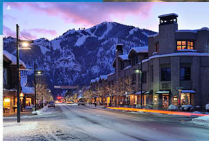
1,2 Sun Valley ski resort 3 Ketchum Tavern 4 Charming town of Ketchum